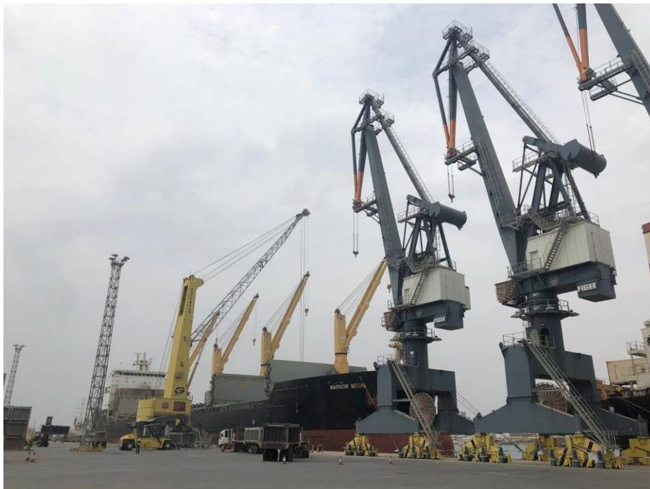
Bisha Mining Share Company loading Zinc and Copper for export at the Port of Massawa

There was no change in tenement holding during the September Quarter 2019.