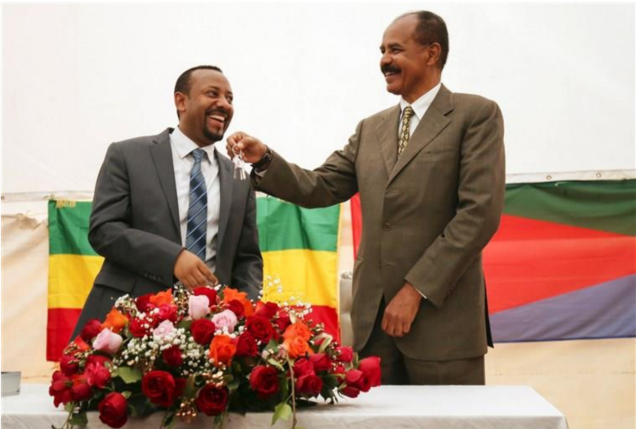
Eritrea's President Isaias Afwerki, right, and Nobel Prize winner Ethiopian Prime Minister Abiy Ahmed