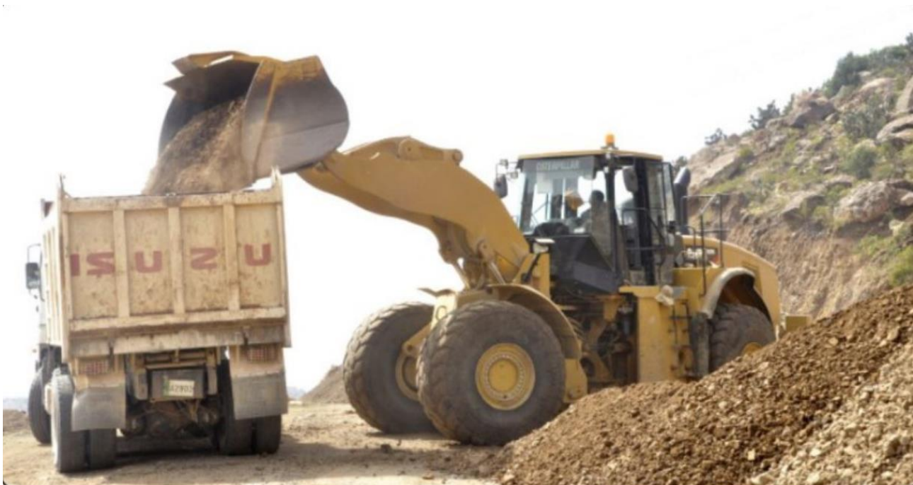
Roadworks in Eritrea