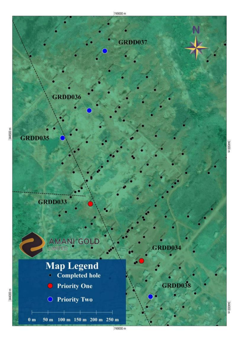
Figure 2. Map of central Kebigada gold deposit, showing the location of planned diamond core drillhole locations (Priority One holes in RED)