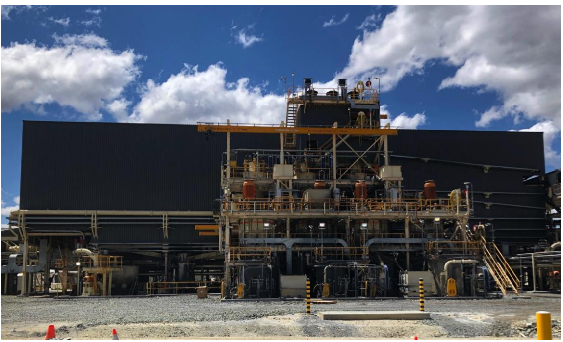
Figure 2 Flotation building during production this quarter.