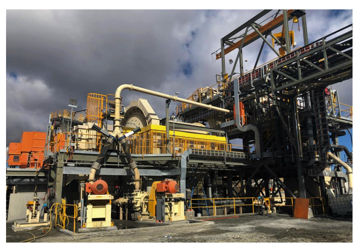
Figure 1 Ball Mill during the underground crushing and grinding circuit commissioning campaign.