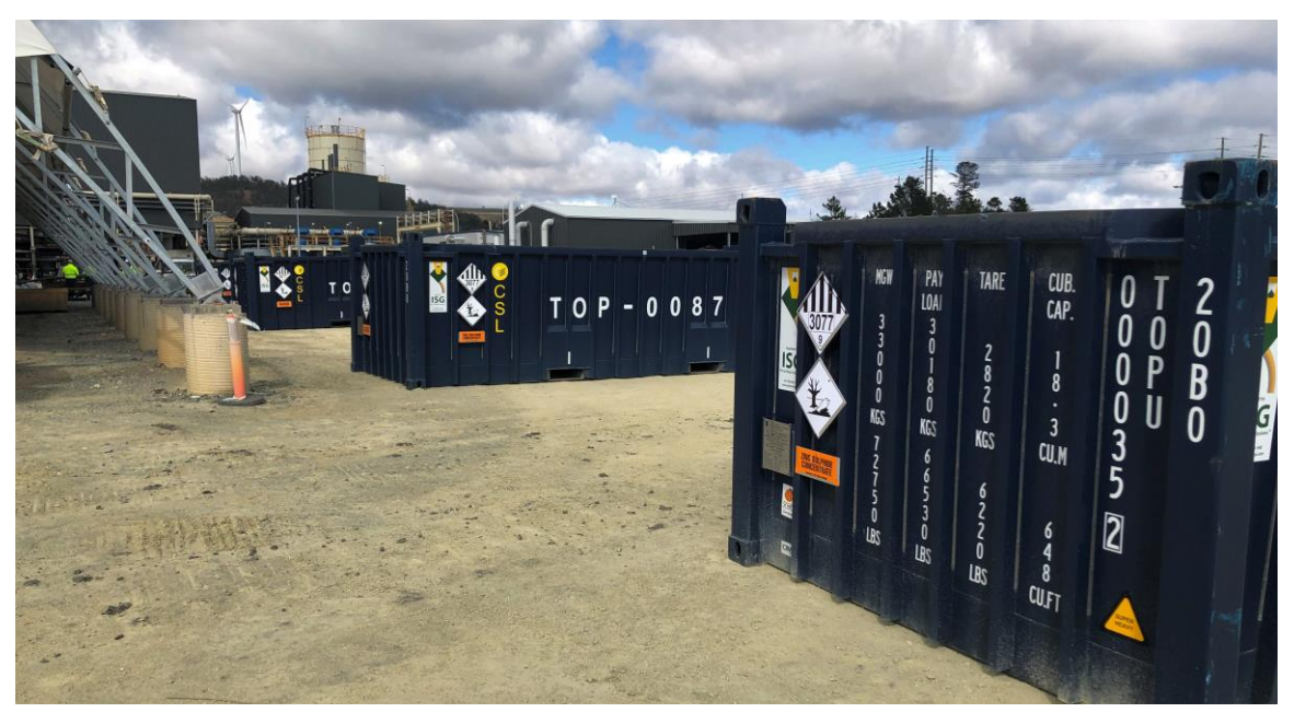
Figure 3: Zinc containers being loaded ready for the train to Port Kembla filling the remainder of the 5,000WMT shipment.