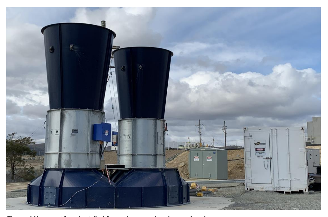
Figure 4 New vent fans installed for underground and operational.