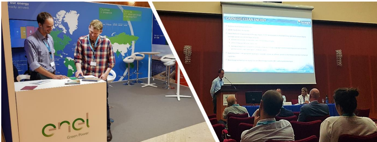
Carnegie's Chief Technology Officer presenting at EWTEC (right) and visiting EGP booth with Senior Engineer (left)