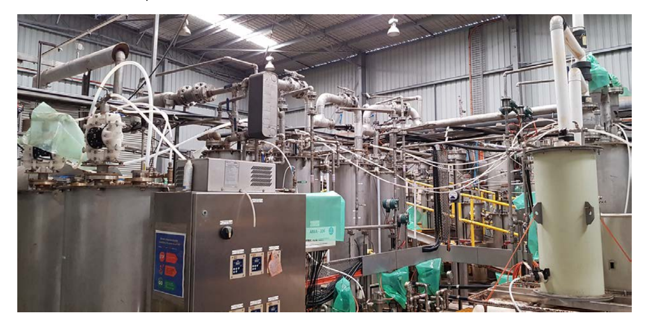
Figure 3. Pilot Plant

During the quarter, QPM inspected CSIRO's pilot plant located in Perth, Western Australia. As part of this inspection, a number of minor modifications were identified as required in order to process the 100t bulk sample. The reason behind this is that ore previously processed at this plant had a much lower iron content than the New Caledonia ore. QPM expects to ship the bulk sample to Perth during the December 2019 guarter.