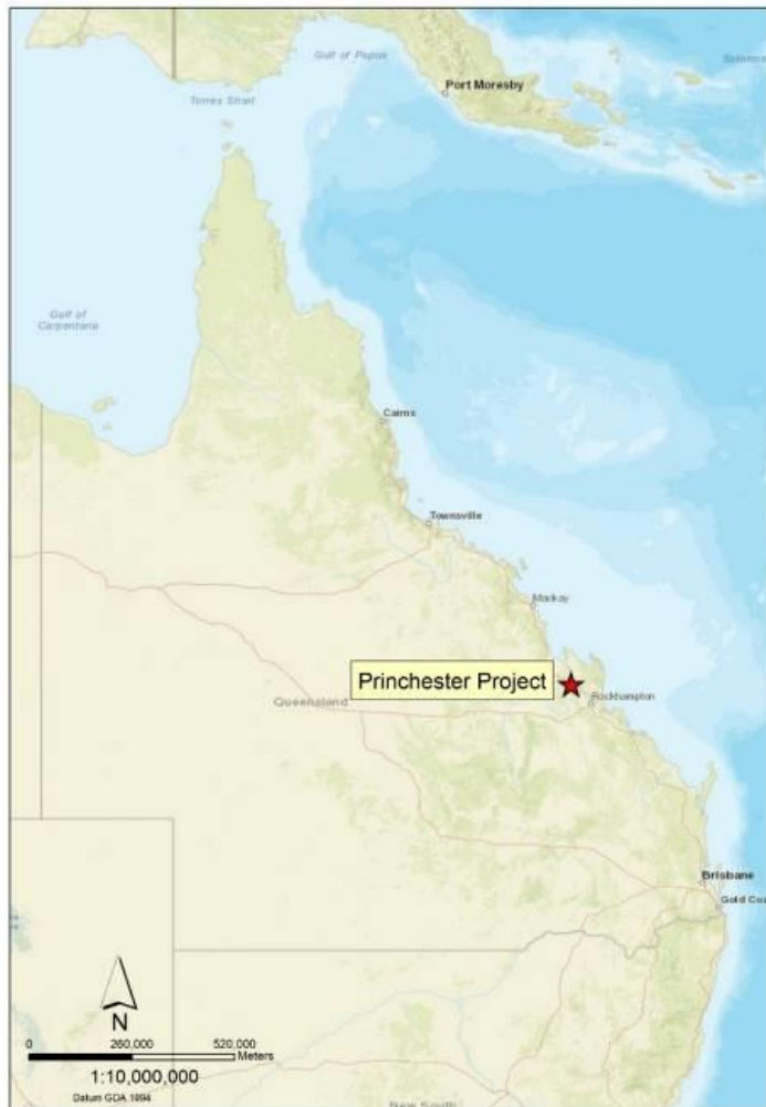
Figure 1: Location of Princhester Project, Queensland