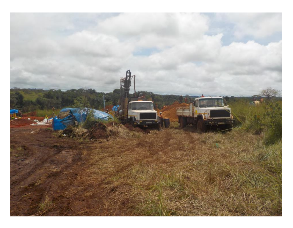
Photograph 1. Reverse Circulation drill rig setting up at drillhole PTRC002