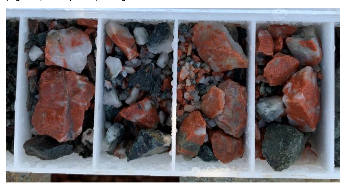
Figure 2 Quartz Adularia Veining from RC drilling at reconnaissance target in the Central Dome area (KMRC227: 26-30m)

Drilling of the newly discovered anomalously mineralized veins (during 2019 reconnaissance work) has commenced with a total of 22 holes for 1,300m proposed. Drilling has been completed at the Central Dome and Camp North areas (Figure 3) with significant structure and quartz adularia veining intersected at both locations (Figure 2). Assays are pending.