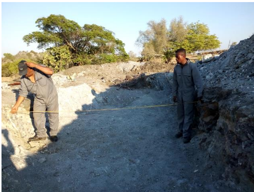
Image 1 – Pre-strip completed at the Maniry graphite project in Madagascar

The mining and excavation activities on site are expected to be completed by late November, and the 60+ tonnes bulk sample is expected to arrive at Beijing General Research Institute of Mining and Metallurgy (" BGRIMM ") in early January 2020. An initial 250kg of Maniry material has already been received at BGRIMM's facility in China, with testing expected to commence shortly, with the aim of establishing optimal operating conditions for the large scale pilot plant program (" Stage 2 ").