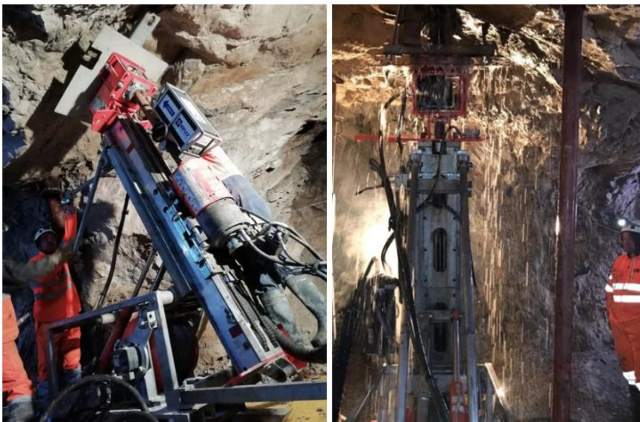
Figure 1: Underground drilling underway at the Pian Bracca zone