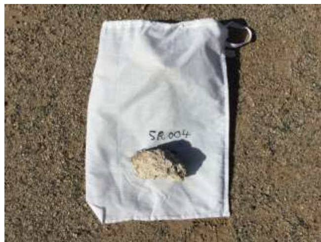
Figure 3. Sample SR004 Paddock Float 25.56% Al 2 O 3

The overall raw Al 2 O 3 assay gives the Company great encouragement as the next process of a wet screening to produce 45-micron sample will remove the silica and other minerals such as micas, the end product (45-micron) will be re-assayed to establish a final grade of Al 2 O 3 .