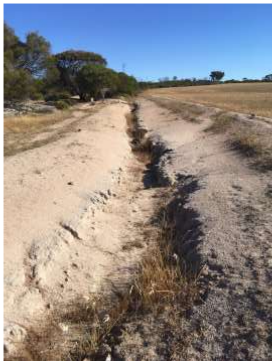
Figure 2: Erosional gully exposing outcropping kaolinitic profile at surface

A total of 13 rock chip samples (see table .1) were taken during the site visit and were submitted to the Intertek Lab for chemical analyses.