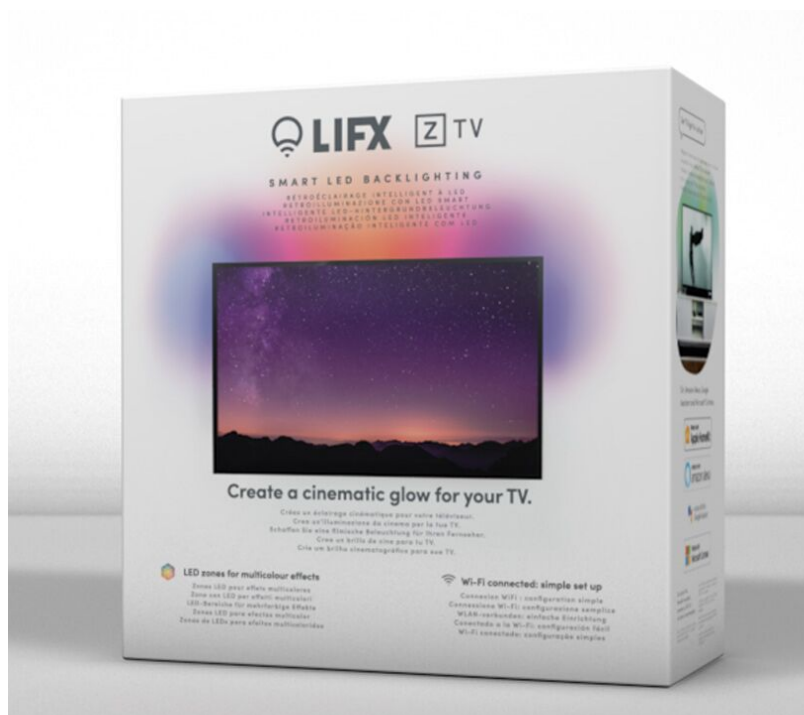
Figure 2. LIFX Z TV is now on sale worldwide.

Featuring Polychrome technology (8 addressable colour zones), and millions of colours, the LIFX Z TV is the perfect solution for bias lighting to relieve eye strain and improve perceived picture quality on both televisions and computer monitors.