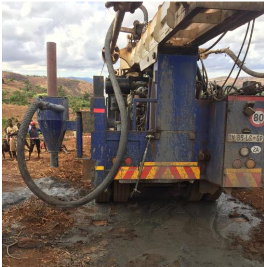
Figures 2 and 3: RC drilling at the Tshipala Project's Small Canyon Prospect