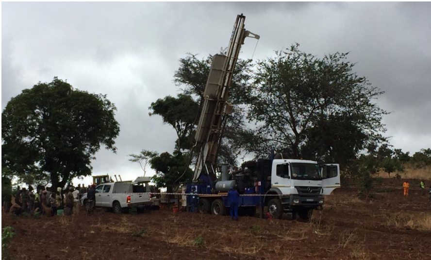
Figure 1: Georoc Pty Limited's RC Drilling Rig at the Tshimpala Project in Malawi

Force Commodities Limited ( Force or the Company ) ( ASX Code: 4CE ) advises that the Company's maiden reverse circulation ( RC ) drilling program at the high-grade lead and silver Tshimpala Project located in the Dowa District of the Republic of Malawi ( Tshimpala Project ) remains on track for completion later this quarter.