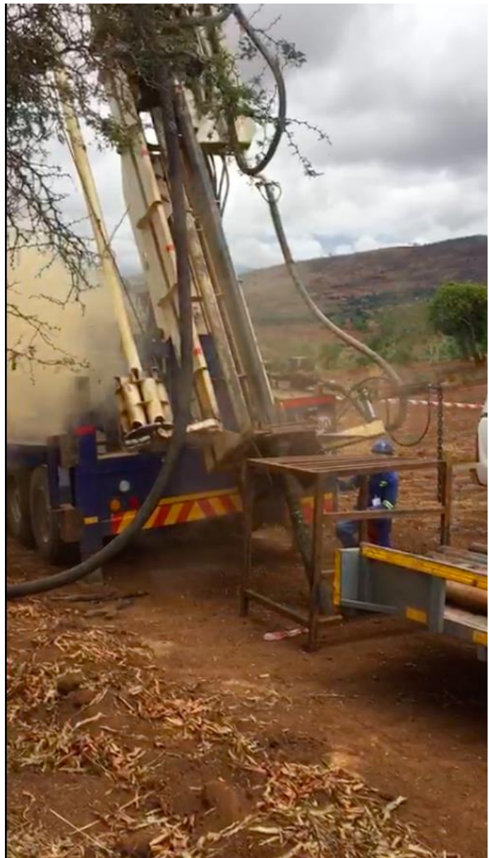
Figure 4: RC Drilling at Small Canyon

The Company's ongoing drilling, exploration and site construction activities are being completed with the full support of the local communities, tribal authority and Dowa district council.