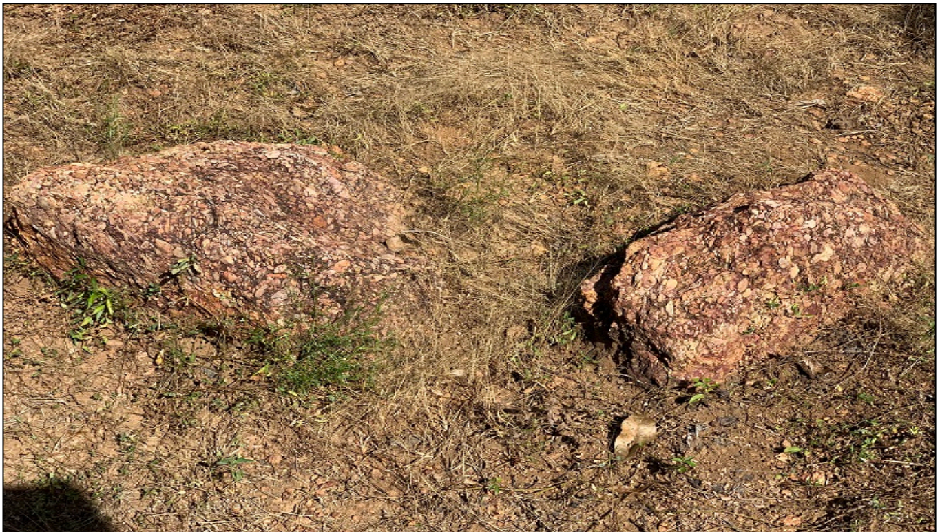
Figure 2: Bouba Conglomerate Bauxite outcropping

Reviewing of the northern edge of the plateau indicates no outcropping basal geology that may reduce the vertical extent of the Conglomerate Bauxite pile, and it also does not indicate a “broken edge” typical of an “in situ” bauxite Plateaux of the region. This highlights the unique geology of this outcropping bauxite pile.