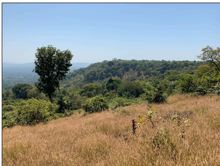
Figure 1: Bouba Conglomerate Bauxite Plateaux

As can be seen in Figure 1 below the Bouba Conglomerate Bauxite Plateaux is not a typical flat, barren Bauxite Plateaux and is characterized by relatively dense growth across a prominent mound.