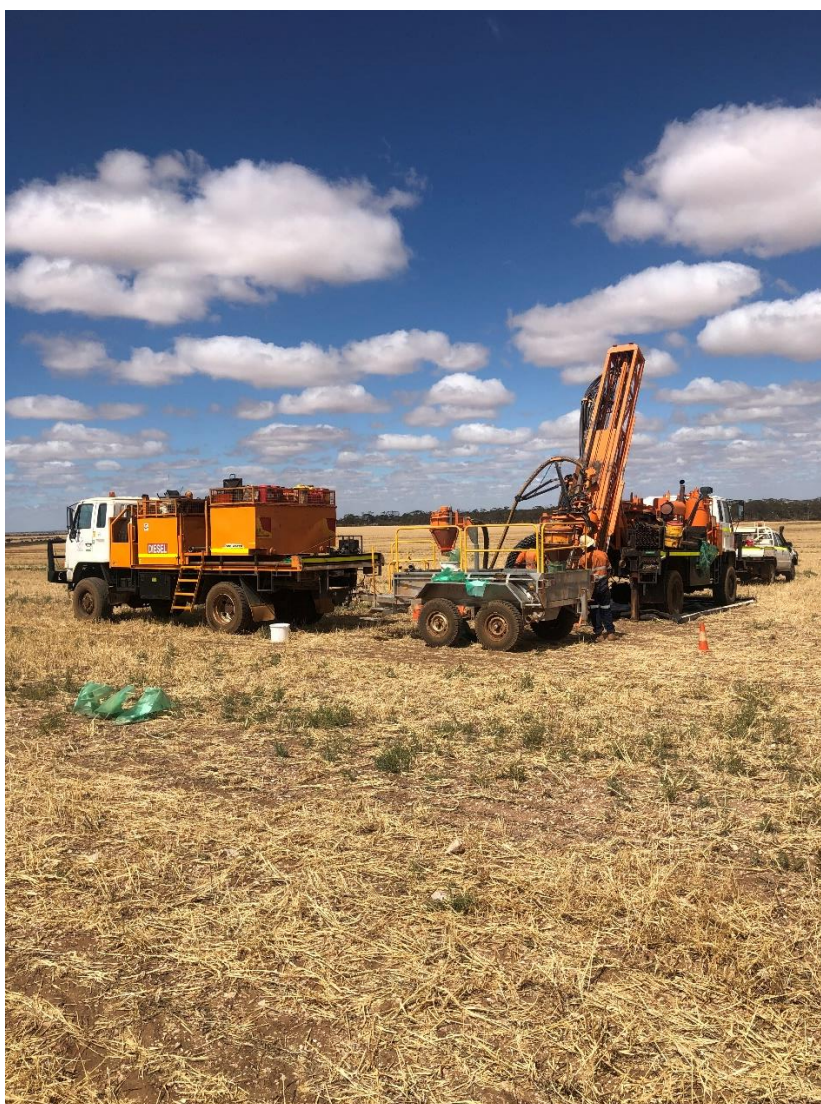
Aircore drilling underway at Bencubbin North

"We're excited to be out drilling our first program at Bencubbin North to test the nickel potential of this prospective belt, as well as a suite of base metals targets that have never before seen a drillhole".