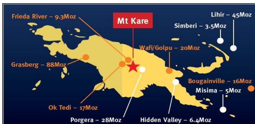
Figure 1: Mt Kare Location Map

Mt Kare is located approximately 600km northwest of Port Moresby and 145km west of Mt Hagen in the Enga Province of PNG and is situated 15km southwest of Barrick’s Porgera Gold Mine. The Porgera Mine is the second largest mine in PNG and is regarded as one of the world’s top ten producing gold mines. It began production in 1990 and to date has produced more than 20Moz of gold.