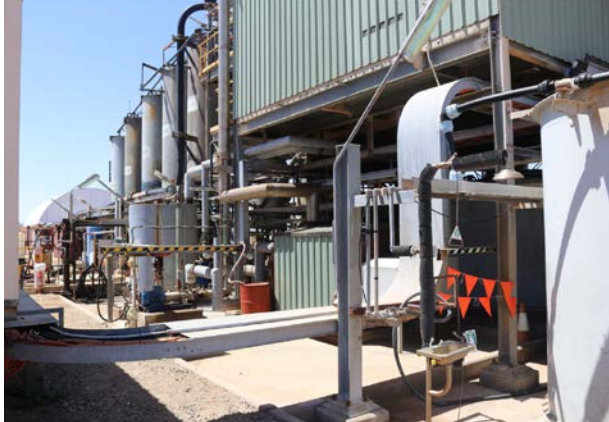
Existing Gold Recovery Plant

The White Dam Gold Operation includes the open pit mines, dump / heap leach, the gold extraction plant and related infrastructure.