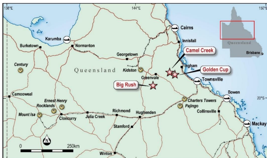
Figure 1: Location of the Company’s gold projects in Northern Queensland

Exploration Permit EPM27283 forms an important part of the Company’s Big Rush project area and surrounds the projects granted Mining Leases (Figure 3). The area of EPM27283 is considered to contain the southwest extensions to gold mineralisation previously mined at the Sergei Pit and to be prospective for further gold occurrences. Historic exploration data is currently being compiled over the area. The permit area is owned 100% by the Company and was granted for an initial period of 5 years.