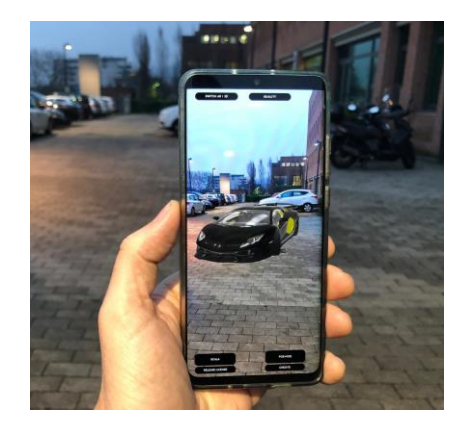
Figure 1: FrameS 20 - 3D and Augmented Reality Features

Vection Technologies Ltd (ASX:VR1) ACN: 614 814 041