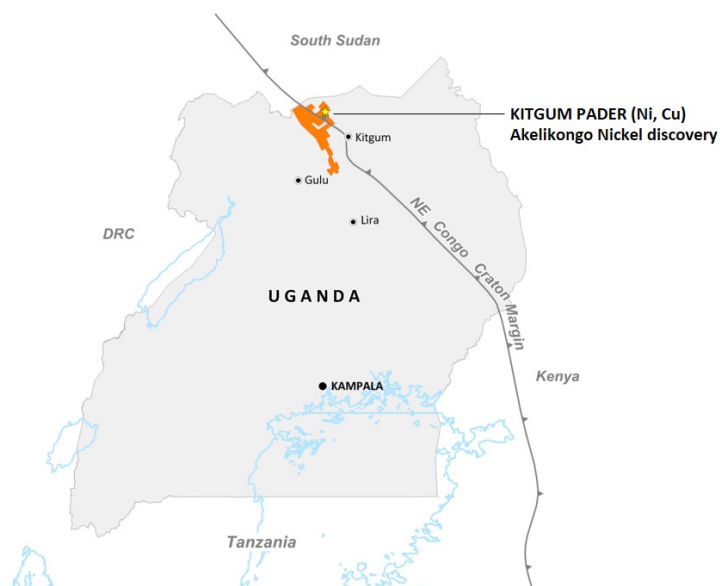
Figure 4 Sipa's Tenement Location in Uganda