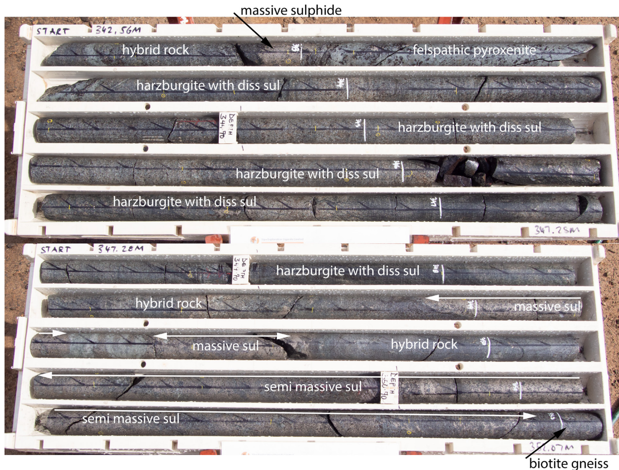
Figure 2: Disseminated, semi and massive magmatic sulphides in AKD029 from 342.5m to 352.1m down-hole

Table 1 summarises hole co-ordinates and depths.