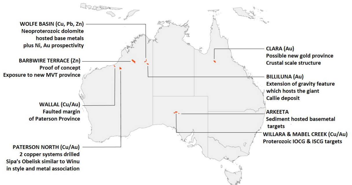
Figure 3 Sipa's Tenement Locations in Australia.