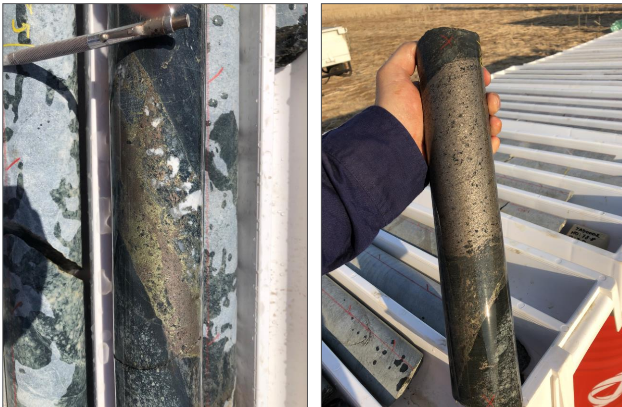
Figure 1. Left: Chalcopyrite and pyrrhotite mineralisation in YAD0001. Right: Massive pyrrhotite mineralisation with minor pentlandite in drill hole YAD0002.

Although the mineralisation identified so far is not economic, the company considers these results very encouraging for a completely new target area at a very early stage of exploration. The results to date have already demonstrated the Project's potential to host multiple magmatic nickel and copper deposits