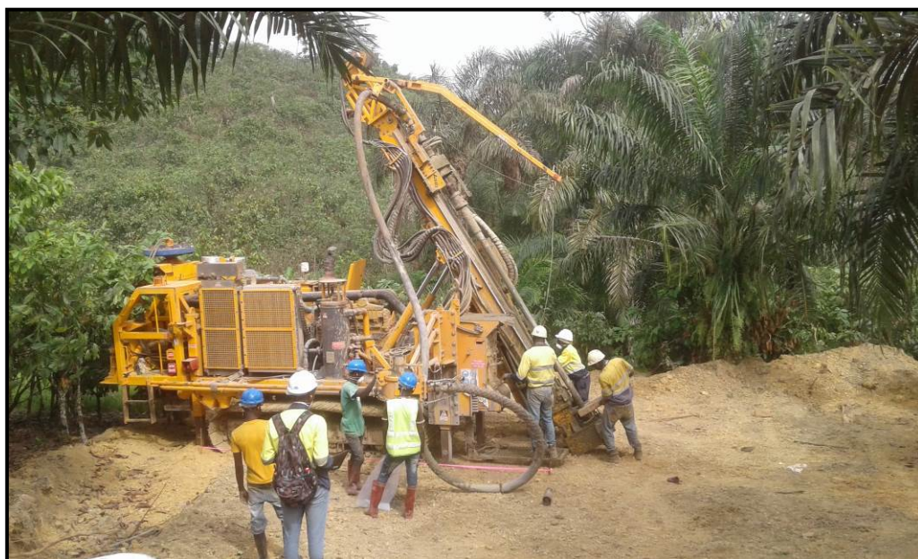
Figure 1: Geodrill's rig KL 300-1 drilling on TUMAC002 at the mid-northern end of Tumentu.

Geodrill who are the Company's drilling contractors are using a KL 300-1 drill rig and are drilling the AC holes at Tumentu on a 12-hour single shift. (Figure 1)