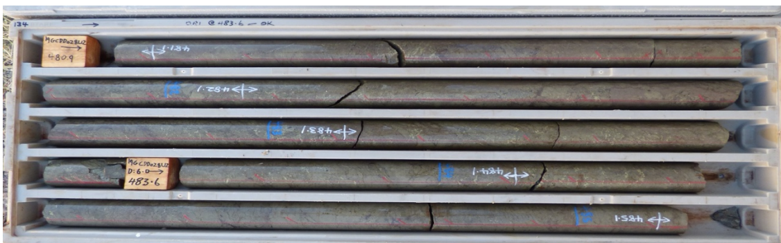
Core from interpreted Smith's United intercept

Additionally, the hole also intersected what has been interpreted to be the down-plunge projection of the Smiths United lode, where it progresses from the traditional host Great Fingall Dolerite into the surrounding Hangingwall Basalts. Significantly, this mineralisation manifested as a massive sulphide intercept, and was not only auriferous, but heavily endowed with both copper and zinc, opening up an exciting new base metals exploration target with a result of 6.3m at 3.71% Cu, 3.73% Zn and 0.73g/t Au from 479.76m.