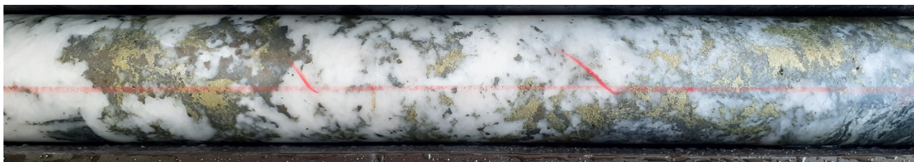
Figure 1: High grade quartz+sulphide vein in underground drill core.

Multiple work streams have been progressed since the last update on 12 December 2019, with the overall delivery schedule on track for completion in the September 2020 Quarter.