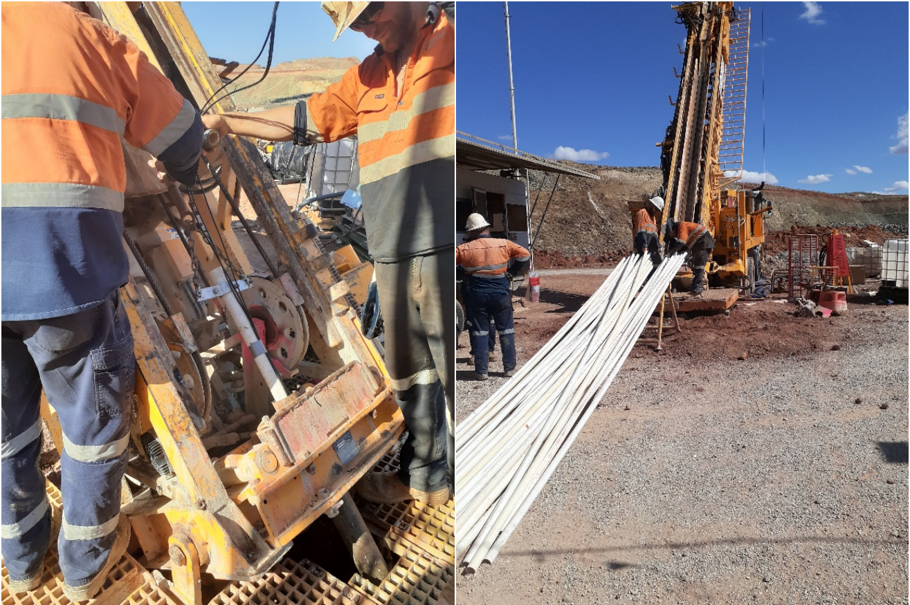
Figure 7: DDH1 installing vibrating wire piezometers in the KOTH open pit as part of geotechnical investigations.

On completion of the installation of all open pit VWP's, DDH1 will commence a 15-hole diamond program at the KOTH projects satellite deposits (Cerebus-Eclipse, Centaurus and Rainbow deposits). These holes will primarily be for geotechnical, hydrogeological and metallurgical evaluation and will be completed in February.