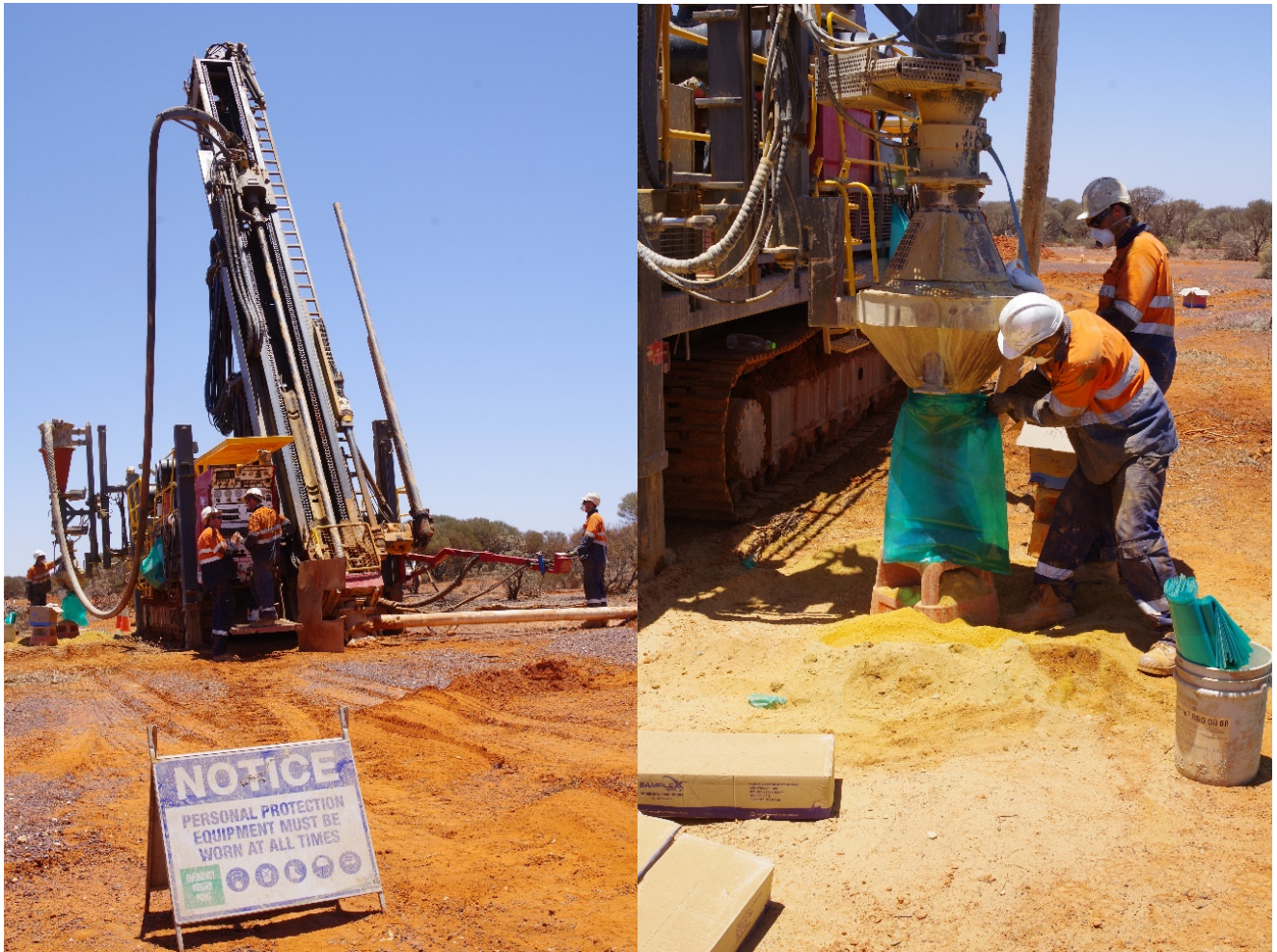
Figure 5: RC drilling at satellite deposit Cerebus-Eclipse.

In-fill drilling at the prospective Cerebus-Eclipse and Centauri near-mine satellite deposits to the north-west of the KOTH open pit is continuing. Drilling contractor Precision Exploration Drilling (PXD) now have two RC rigs dedicated to the program, which has completed 102 holes from the planned 126 holes ( 17,000 metres ) as at date of this announcement. The program remains on track for completion in January 2020.