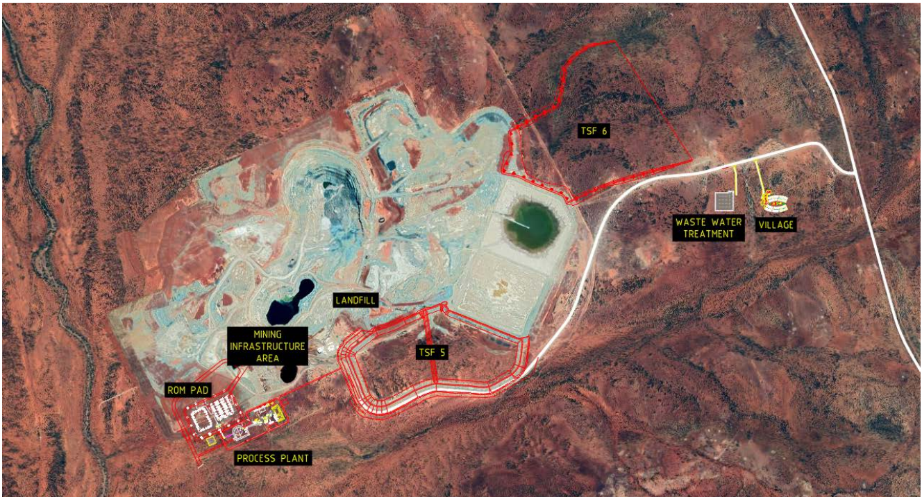
Figure 2: Aerial view of KOTH Site showing most recent designs of TSF5, TSF6, Process Plant and Village.

GR Engineering Services (GRES) were engaged in late 2019 to produce a preliminary infrastructure design and layout. The Red 5 FFS team has been reviewing the initial designs in conjunction with GRES and have developed a preliminary tender package list. Designs are well advanced for TSF 5 and TSF 6 (Knight Piesold), the Process Plant and the Accommodation Village.