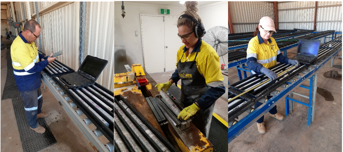
Figure 4: Underground drill core at various stages of preparation and logging.