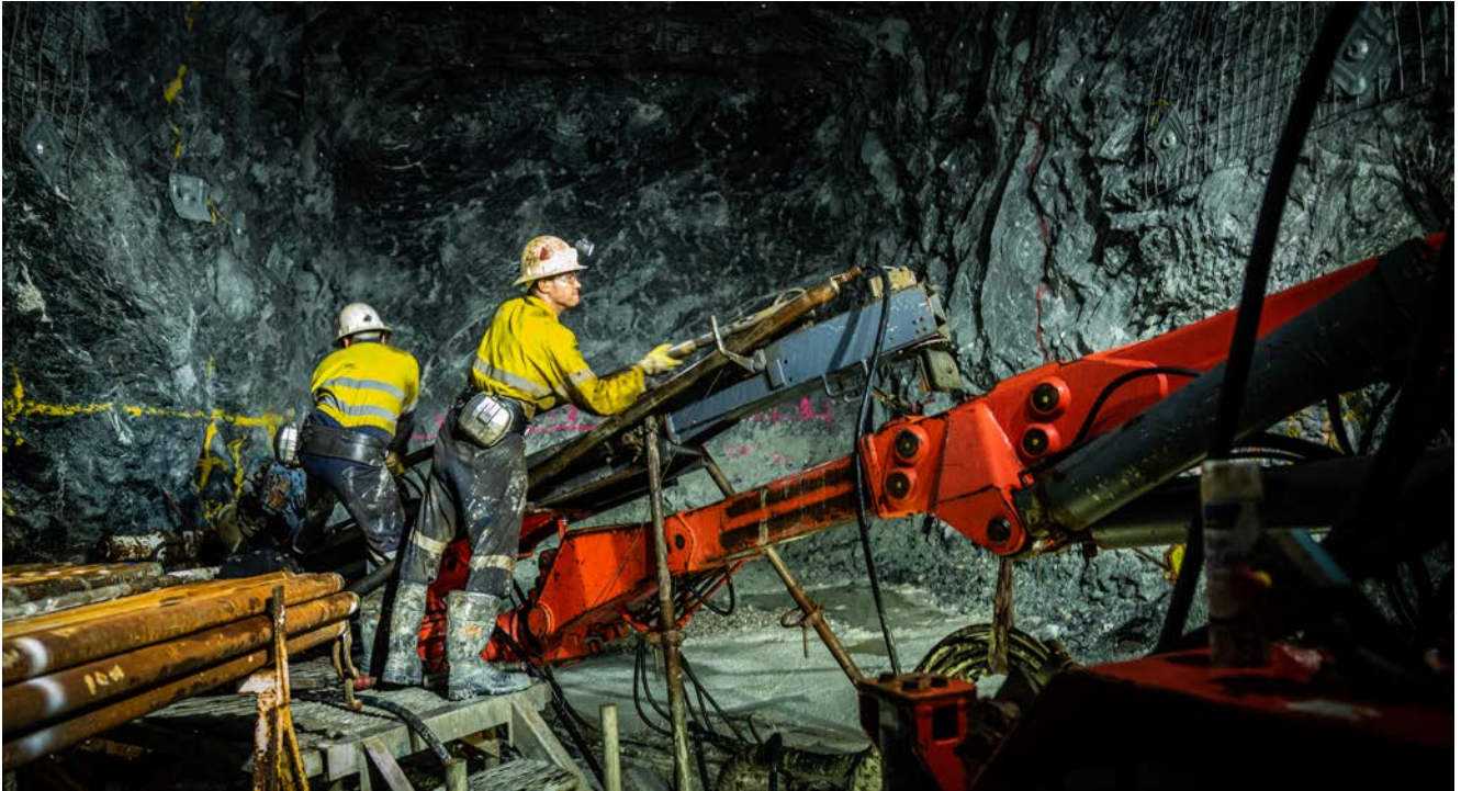
Figure 3: Underground drill contractor AUD.