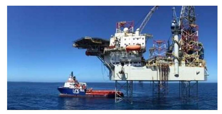
Noble Tom Prosser Drilling Rig during the Caley well test

The Joint Venture is expected to commence the Front End Engineering and Design ("FEED") phase in early calendar 2020. During the FEED process, the final development and contracting strategy will be selected for key components of the development. These include decisions on the