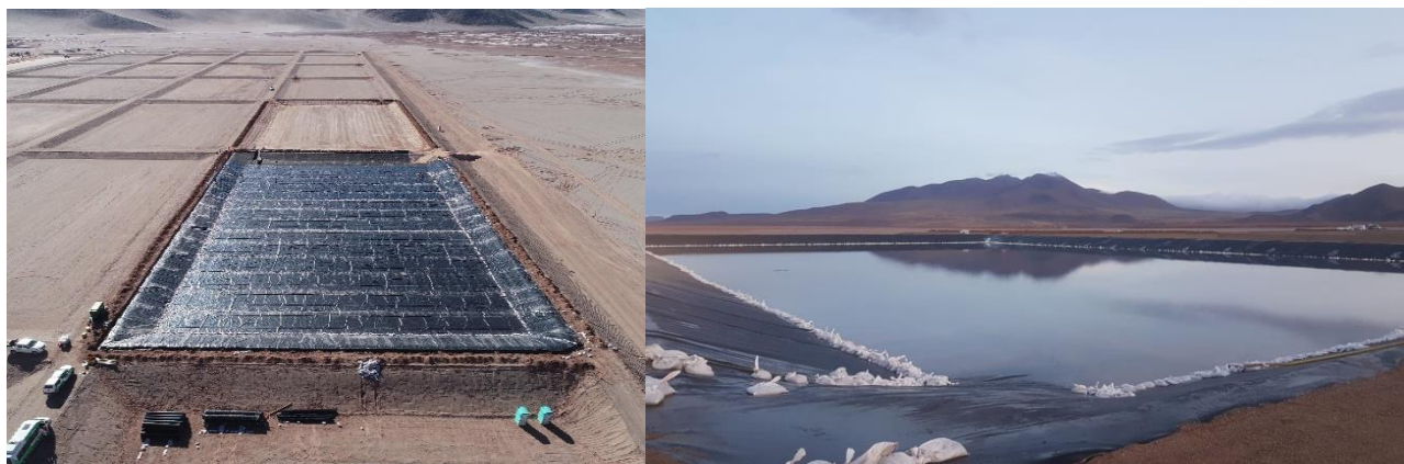
Figure 1: Lining and filling of demonstration ponds at Sal de Vida

Engineering studies related to logistics and energy studies progressed as planned throughout the quarter.