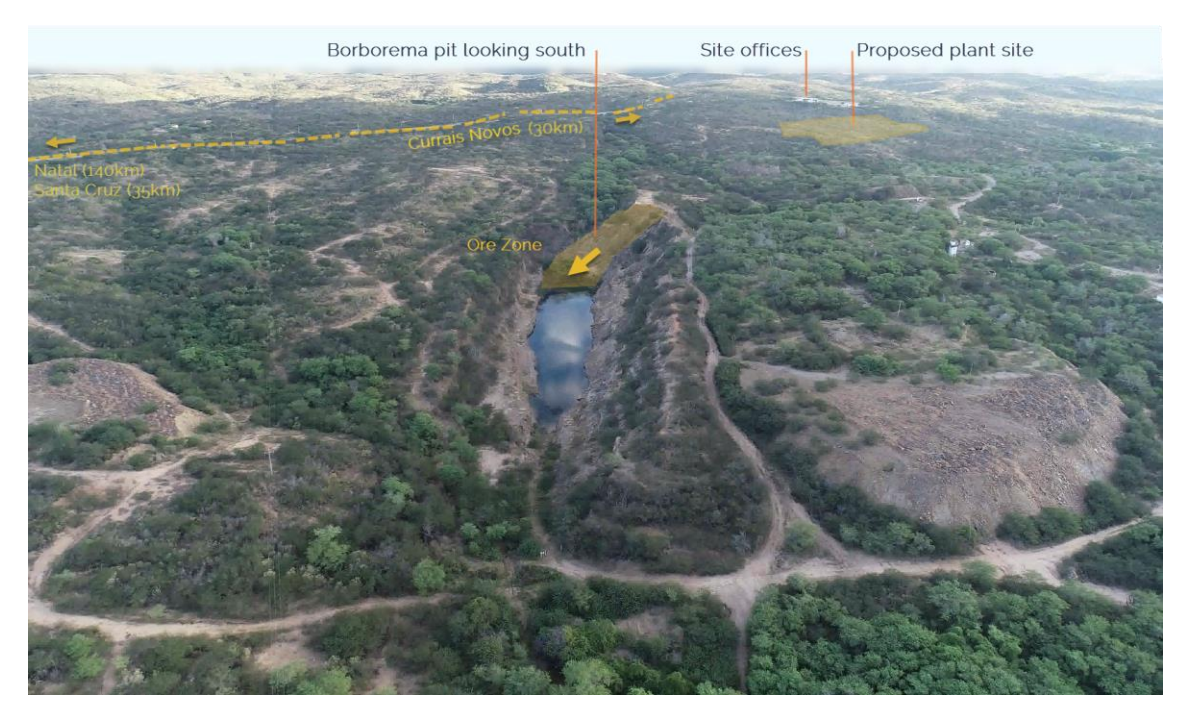
Figure 1. View to the south over Borborema Project site showing gold mineralisation exposed in the pit and proximity of infrastructure. Transmission line to the left of the pit links with main power grid crossing the Borborema leases.

Commercial opportunities in terms of mica by-products will continue to be investigated with metallurgical testwork and market assessment through ANZAPLAN in Germany to assess the potential for saleable quality product. If proven viable, potentially significant revenues could be added for relatively little cost. It would require some amendments to the process design but provision has been made for that in the design.