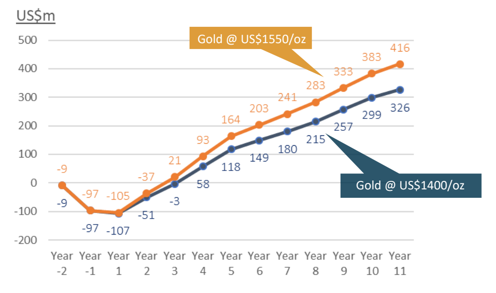
Figure 3. Cumulative Cash Flow - Unleveraged (US$m)