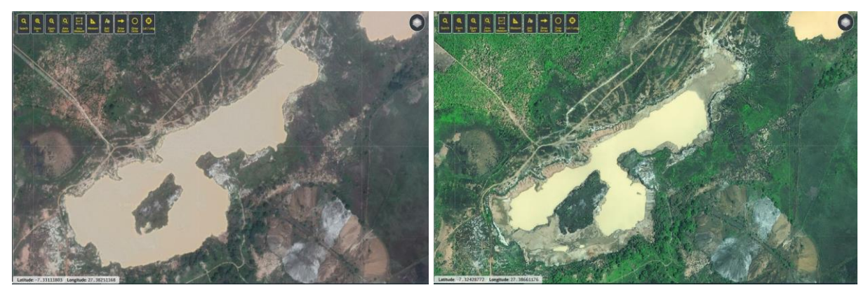
Original water surface (left) and remaining water in the Roche Dure (right)

Once dewatering of the pit is completed, AVZ intends to undertake further sampling of the pegmatite that is exposed in the pit floor to upgrade Mineral Resource categories from Inferred to Indicated and from Indicated to Measured. The time taken to conduct this extra sampling is not expected to affect the timeframe for the release of the DFS in Q1 2020.