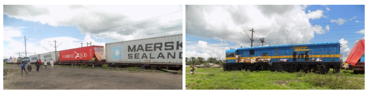
SNCC Train at Kabondo Dianda Railway station some 200km from Manono

The refurbished railway line within Angola was completed some four years ago and is of international standard. In order for AVZ to make use of this rail route, AVZ would need to upgrade approximately 220km of existing gravel road between Manono and the railhead north of Tenke at Kabondo Dianda, during the construction phase of the Manono mine. This route presents as the simplest and most cost effective investigated to date.