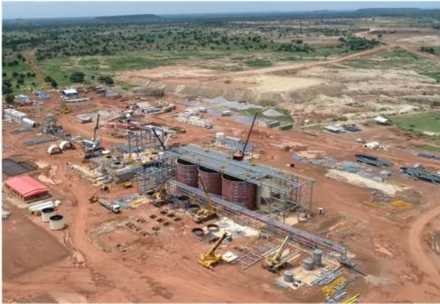
Plant area as at end of September 2019