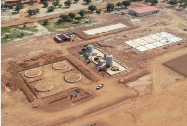
Power station, HFO storage area at end of September 2019