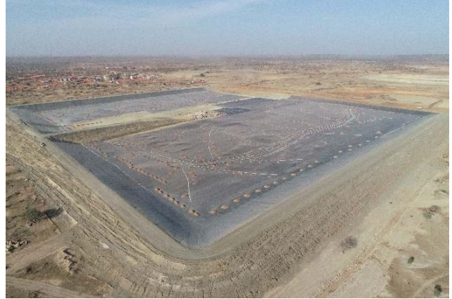
TSF as at end of December 2019