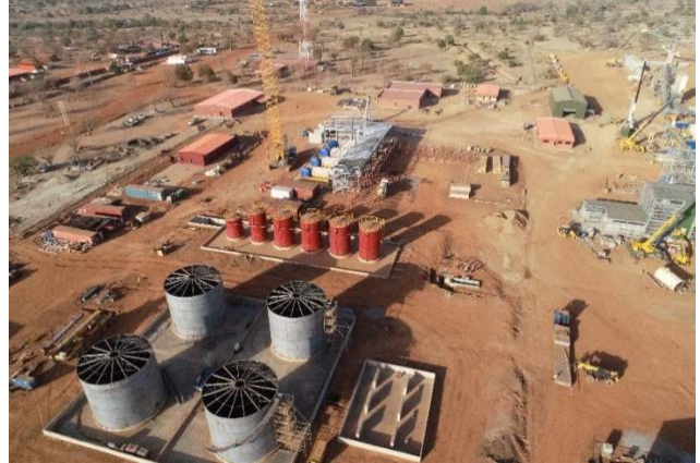
Power station, HFO storage area as at end of December 2019