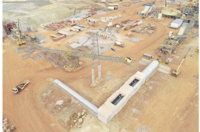
Reclaim tunnel – early December 2019