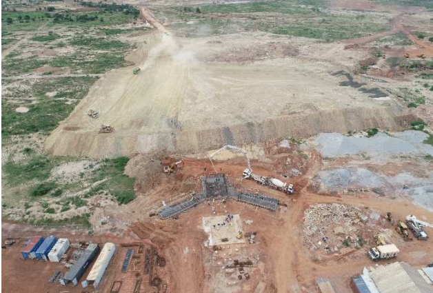
Rom pad and feed – late September 2019