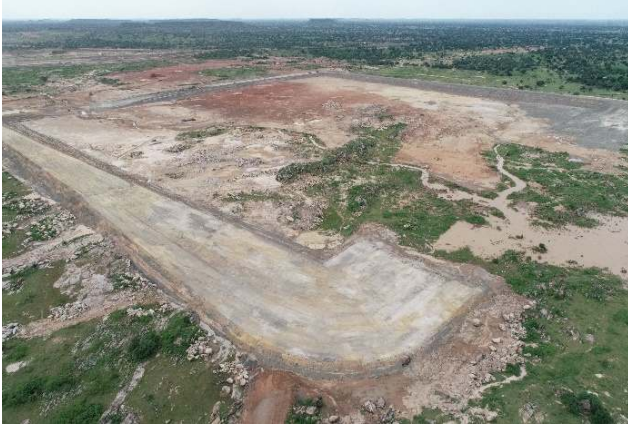
TSF as at late September 2019