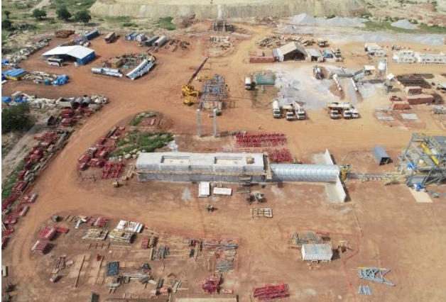
Reclaim tunnel and pebble crusher pad in September 2019