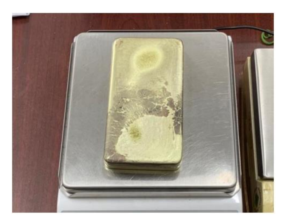
Gold bar (5.08Kg purity 99.9999%) post-refining at Hong Kong refinery