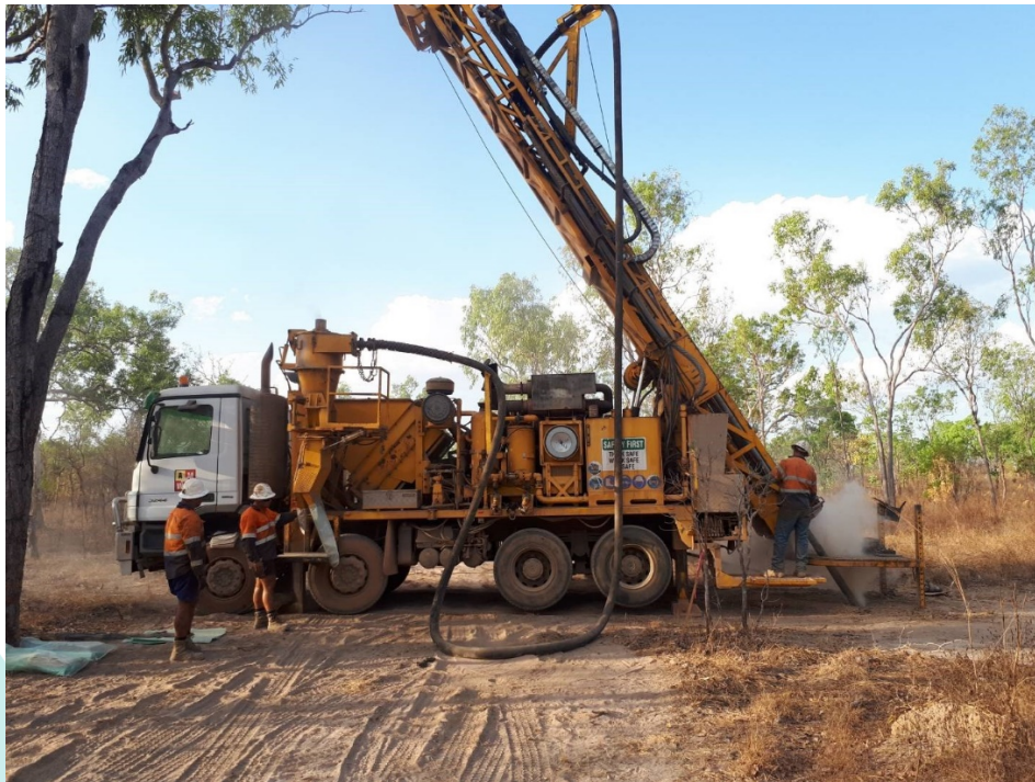
Figure 1: Drill Rig on site, Pine Creek region, Northern Territory.

In light of these results, the Company will now conduct a thorough desktop review of all future planned activities to be completed at the Wild Horse Hill Project.