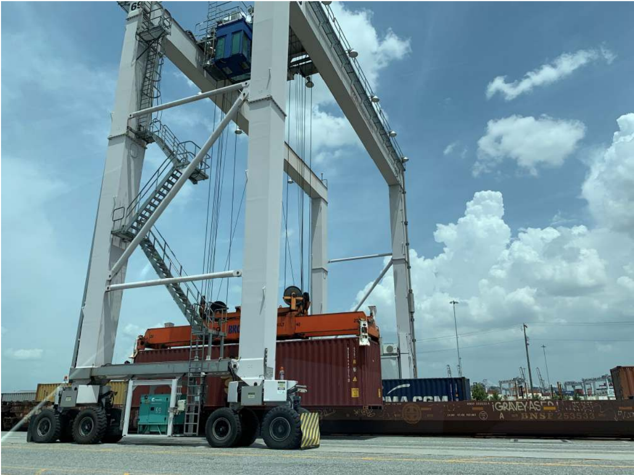
Figure 4. One of approximately 150 rubber tyred gantry cranes currently operating at Port of Savannah