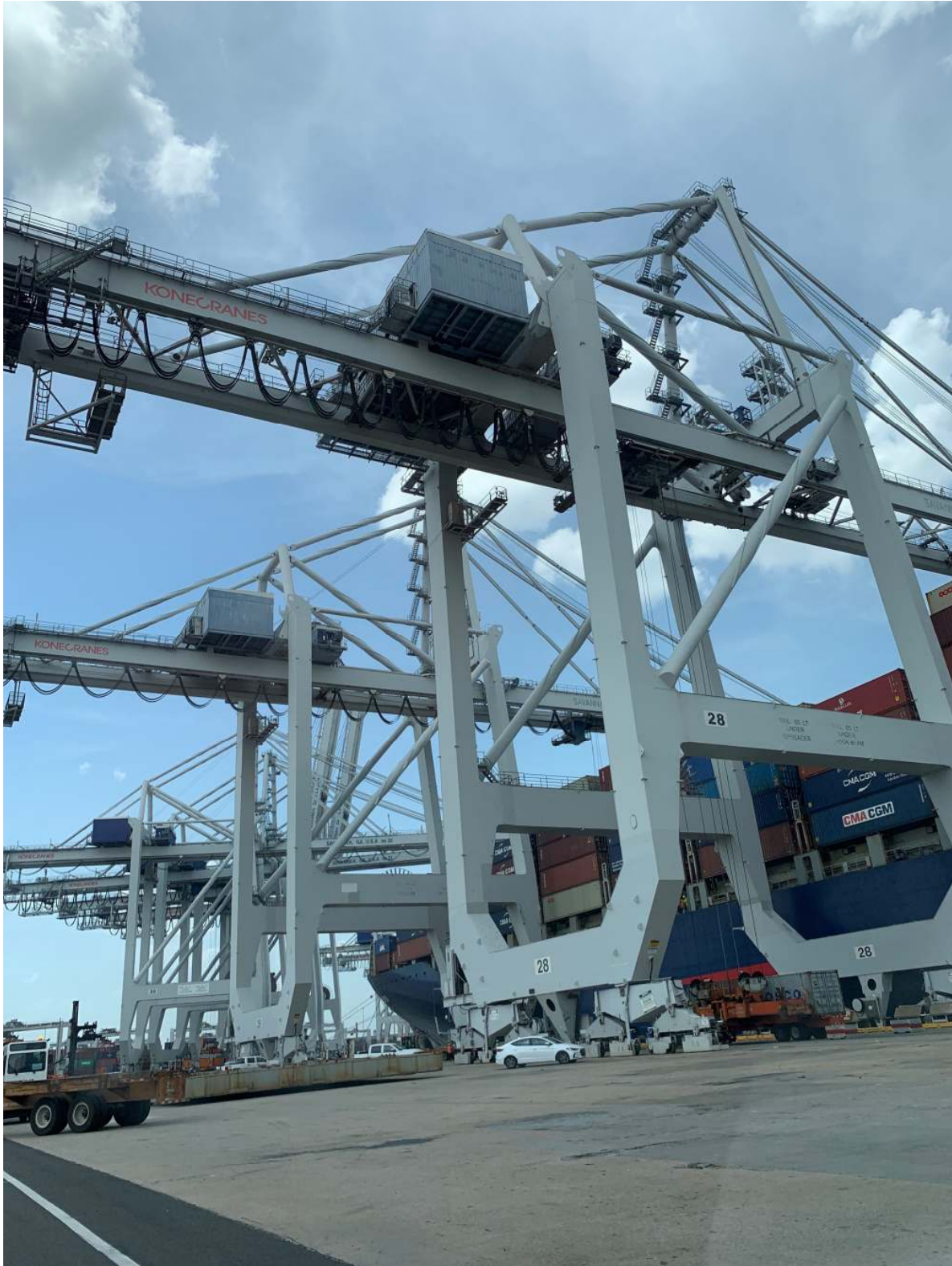
Figure 3. Some of approximately 30 ship-to-shore cranes currently operating at Port of Savannah