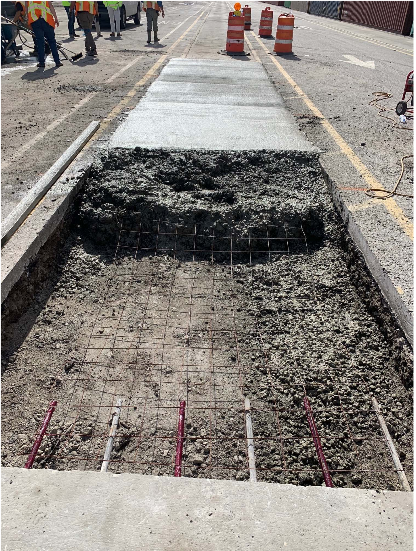
Figure 1. EdenCrete®- enriched concrete being poured at Garden City Terminal, Port of Savannah