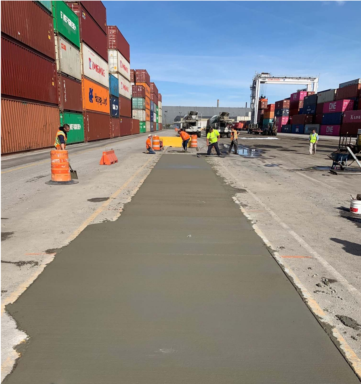
Figure 2. EdenCrete®- enriched concrete being poured at Garden City Terminal, Port of Savannah