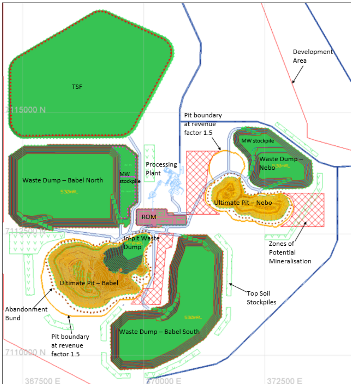
Figure 3: Mining Layout

The final pit design is the basis of the Ore Reserve estimate. The Mineral Resource within the final pit design was converted to Ore Reserve by applying a Net Smelter Return (NSR) cut-off value of $28/t ore.