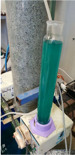
Image 1 / Column C Leach Solution