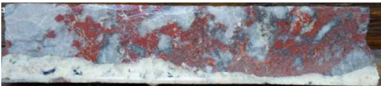
Fig 1. High grade bastnaesite mineralisation (red) from North T deposit

“These results are particularly significant – among the highest grades of any rare earth project in the world . The exceptional REO grades, with up to 8.1% NdPr, are being reported almost at surface, an ideal outcome for our plan to produce a high-grade REO concentrate from Nechalacho. This drilling is testing the near-surface Bastnaesite Zone at our North T deposit, which is expected to be our starter pit of the operation. The company is moving very quickly, and we expect to release an updated Resource incorporating these results before the end of March 2020.”