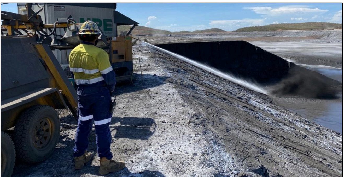
Figure 3: Hydraulic mining operations at the Century Zinc Mine

In addition to the rougher circuit upgrade, the Company is also bringing a fourth and final mining cannon online as part of the expansion to 12Mtpa throughput. The hydraulic mining operations at Century have achieved significant improvements since New Century personnel took over mining operations from the previous contractors (in October 2019), with each cannon now achieving up to a 33% higher mining rate than previous operational output (up from a maximum 3.0Mtpa to up to 4.0Mtpa each cannon).