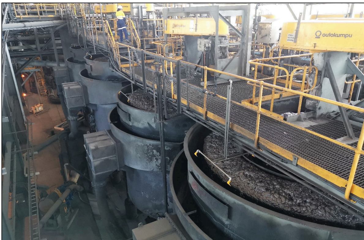
Figure 1: Southern rougher train online at the Century Zinc Mine, allowing the full capacity of the entire plant to come online for the first time since operations restarted

The rougher expansion also allows for continued lowering of overall unit costs of production via increasing metal production against a 70% fixed cost base on site.