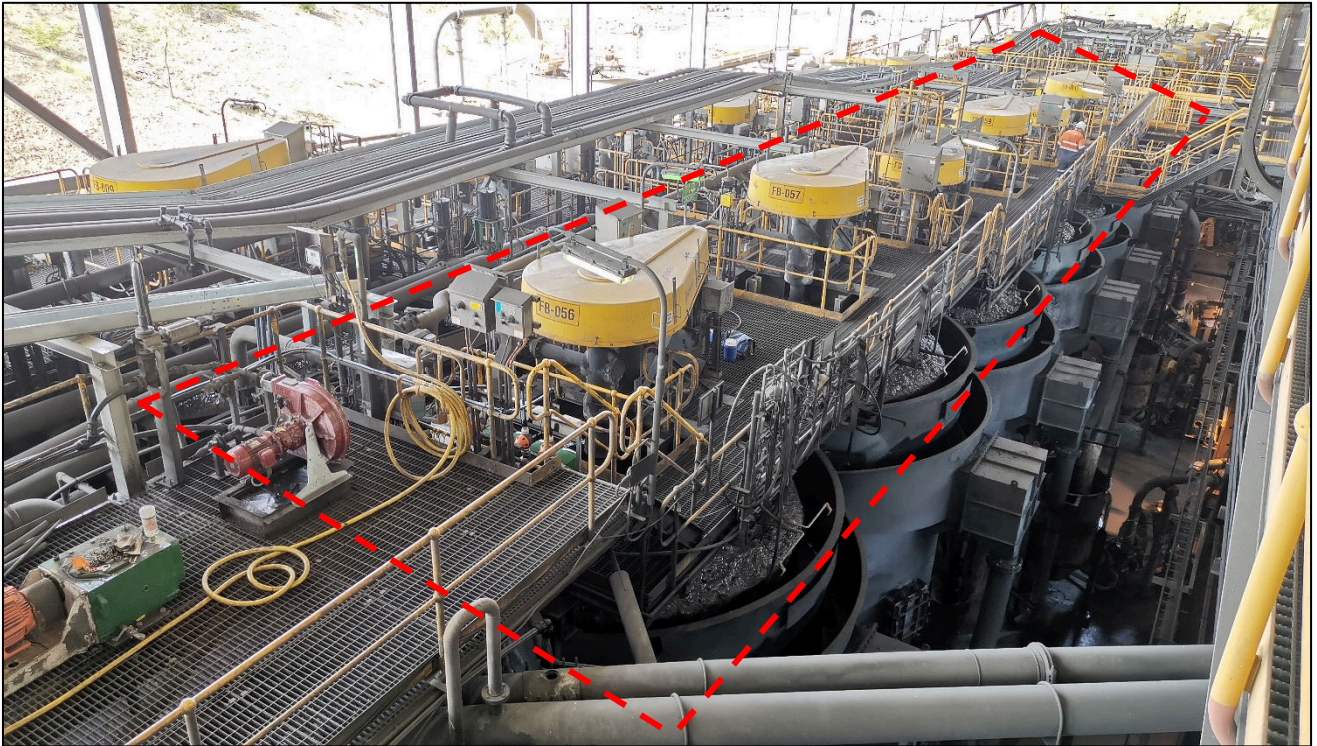
Figure 2: Southern rougher train (red dotted area) now online

In addition to the rougher circuit upgrade, the Company is also bringing a fourth and final mining cannon online as part of the expansion to 12Mtpa throughput. The hydraulic mining operations at Century have achieved significant improvements since New Century personnel took over mining operations from the previous contractors (in October 2019), with each cannon now achieving up to a 33% higher mining rate than previous operational output (up from a maximum 3.0Mtpa to up to 4.0Mtpa each cannon).