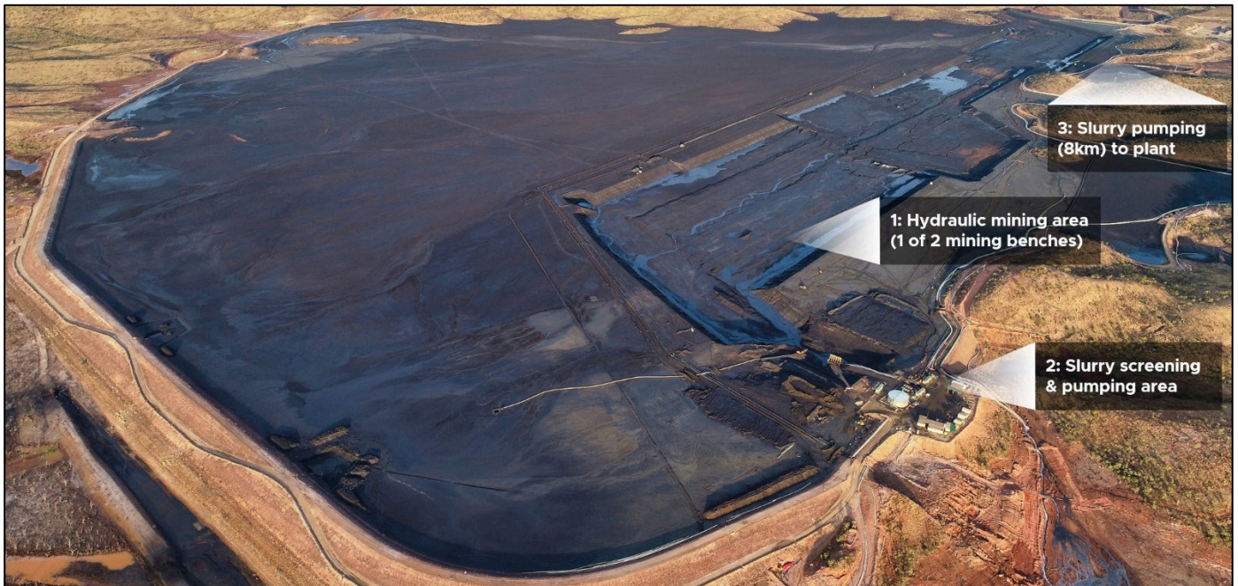
Figure 4: Overview of hydraulic mining operations at the Century Mine tailings dam