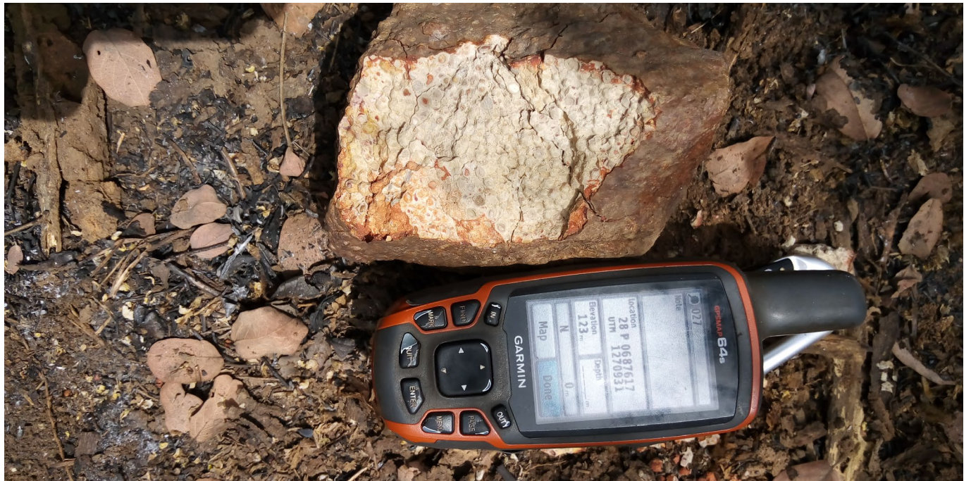
Figure 3: Bouba South Outcropping Conglomerate Bauxite

Figure 3 below shows outcropping Bouba South Conglomerate Bauxite showing the Conglomeratic pebbles as identified by the Company’s Geologists undertaking exploration field works.