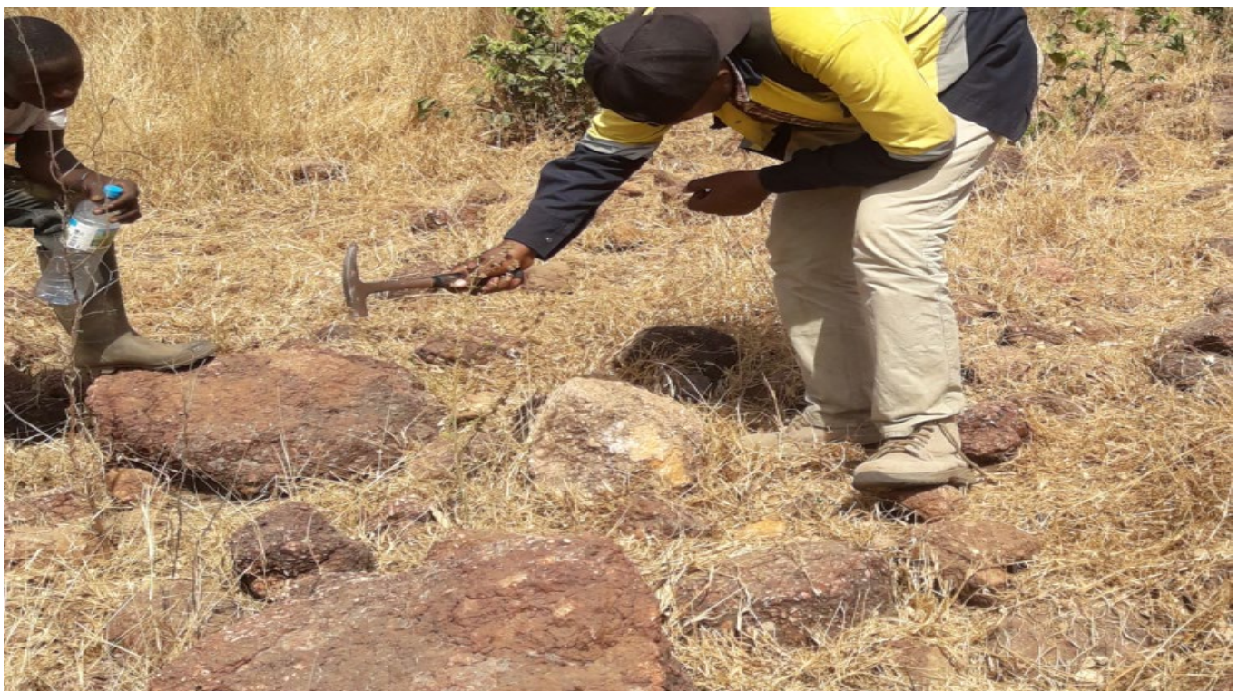
Figure 2: Bouba Plateau Northern Extension Outcropping Conglomerate Bauxite

Figure 2 below shows outcropping Bouba North Conglomerate Bauxite identified and the Company’s Geologists undertaking exploration field works.