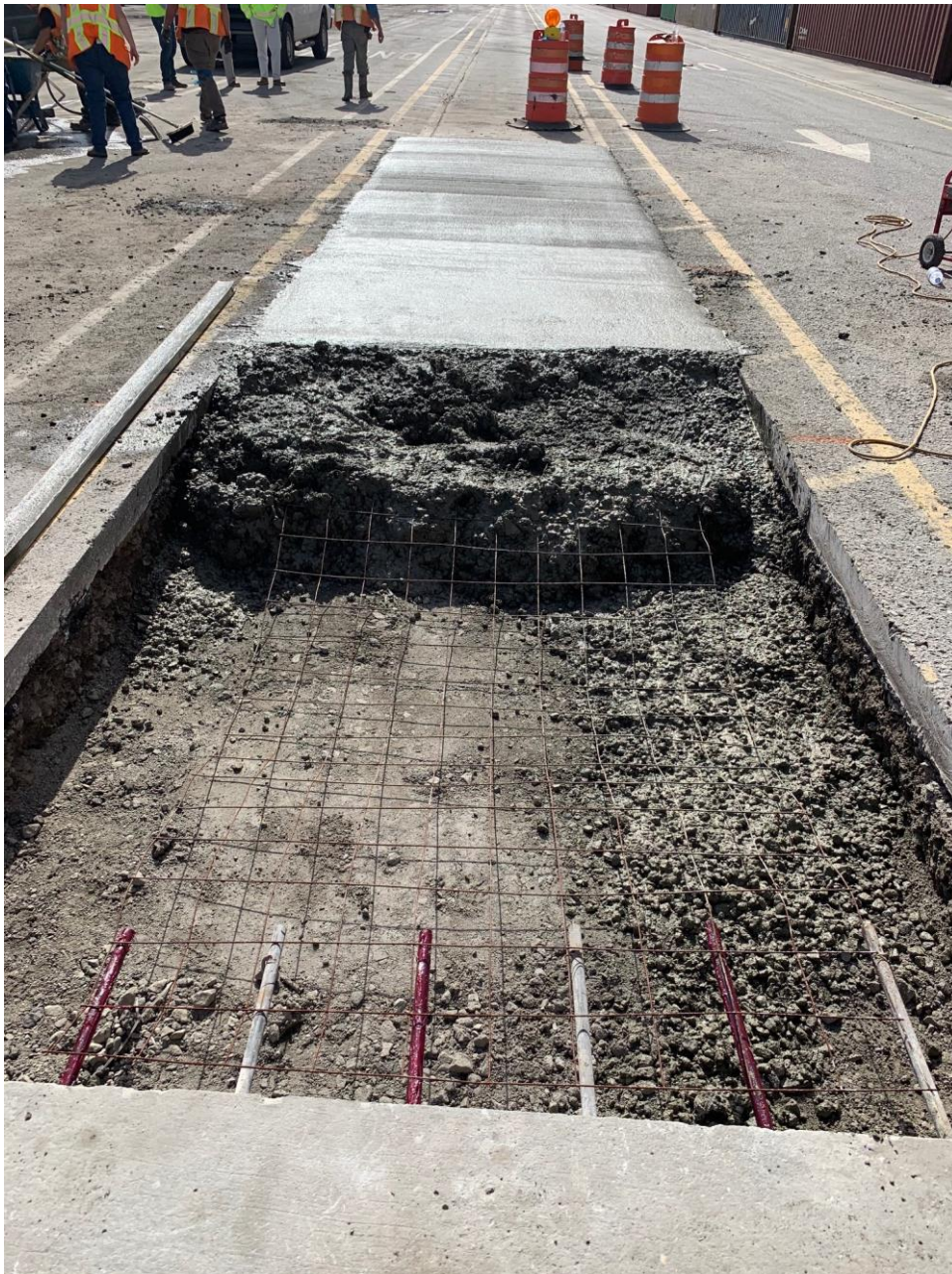
Figure 1. EdenCrete® - enriched concrete being poured at Garden City Terminal, Port of Savannah

The trial involves monitoring the on-going performance of the EdenCrete® concrete over the coming months. There is no set period for the trial, although Eden understands that the review of the performance is likely to undertaken over approximately three months.