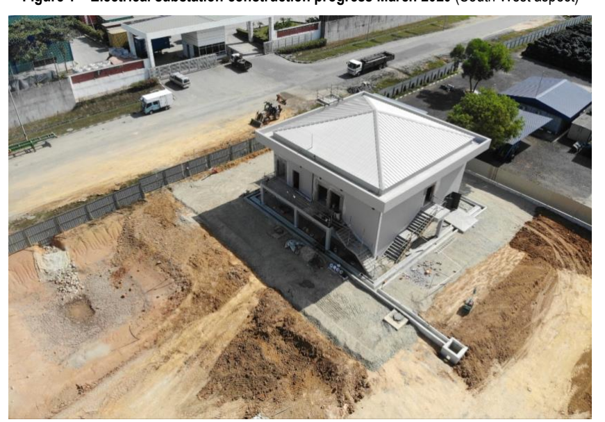
Figure 1 – Electrical substation construction progress March 2020 (South West aspect)

Construction progress can be viewed at https://www.youtube.com/watch?v=xWJYMHXLK0Q