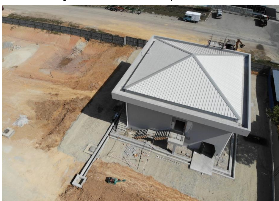
Figure 4 – Electrical substation roof completion March 2020