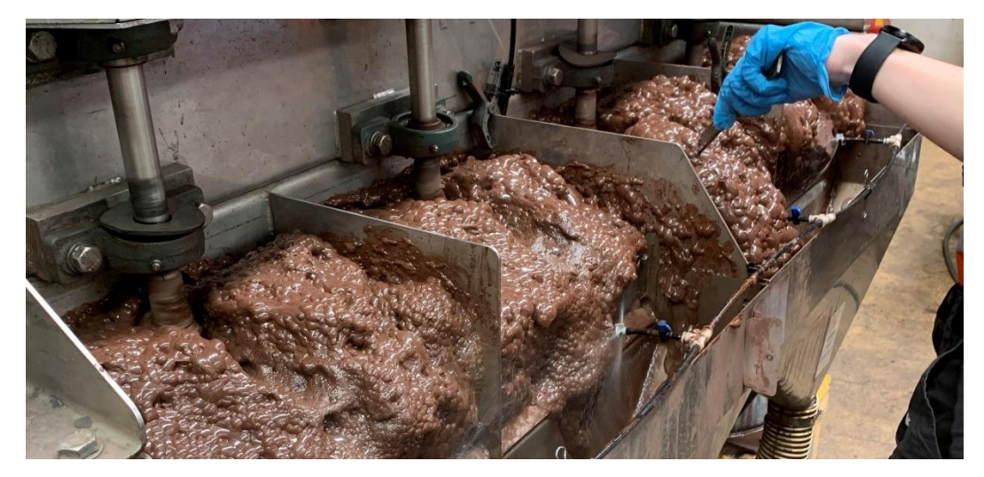
Figure 4 - Reverse Silica Flotation Circuit Pilot Test

Reverse silica flotation, the final step in the Project flowsheet, is displayed in Figure 4 below. This polishing step has proved to be critical in the production of high quality, low silica concentrate.