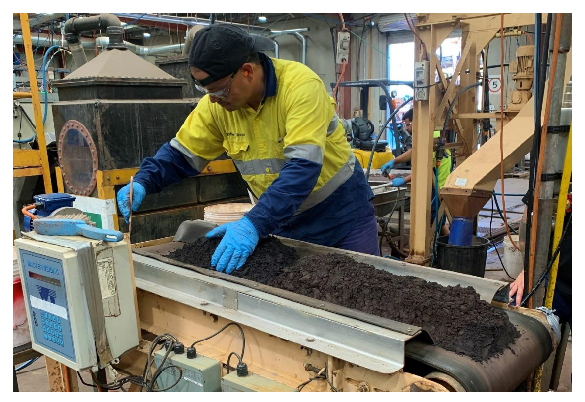
Figure 1 - Magnetic Concentrate Feed to Regrind Mill

'A key indicator of success in bringing a project into production is a full understanding of the ore body and how it behaves and the processing methodology that will be used. Test work begins at bench scale in the laboratory and once the process has been proved at that scale, a larger set of tests are undertaken to ensure that when the project is built at full scale it will work properly. During the test work at bench and pilot scale lessons are learnt and modifications are made to the circuit and retested and refined until the process is ready for full scale. This is the reason that AVL is taking so much care to do this work properly and reduce risk down the track.'