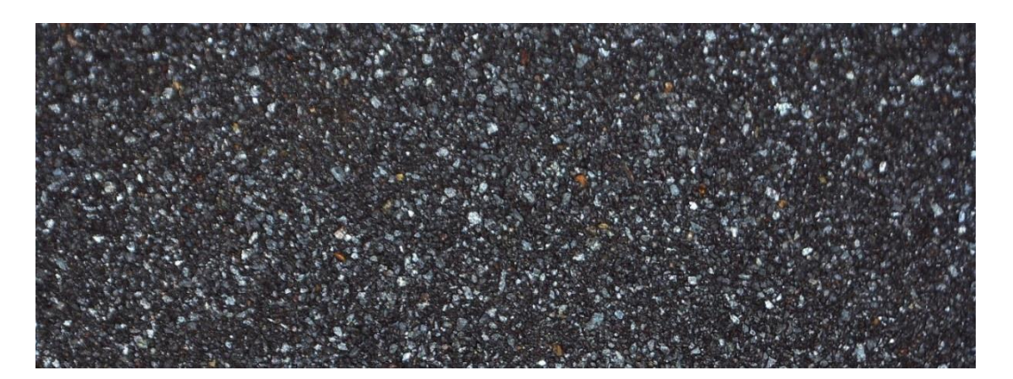
Figure 3 - LOM Final Vanadium Titanium Iron Concentrate - Flotation Sinks

Test work results indicate that the concentrator can recover 76% and 69% of vanadium fed in the LOM and Y0-5 blends respectively. Importantly, concentrate quality for both blends are exceptional at 1.37% and 1.39% V_2O_5 respectively, with silica grades less than 1.9% SiO<sub>2</sub>. Silica is a contaminant that has a large impact on vanadium extraction, reagent usage and overall product quality in the manufacture of V_2O_5 . It competes with vanadium for the soda ash reagent in roasting, while supressing vanadium extraction. Soluble silicates then require additional reagents in a downstream desilication step. Clean final concentrate product can be seen in Figure 3 below.