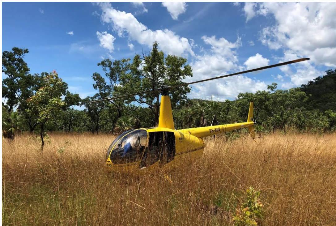
High Priority Targets Accessible only by Helicopter