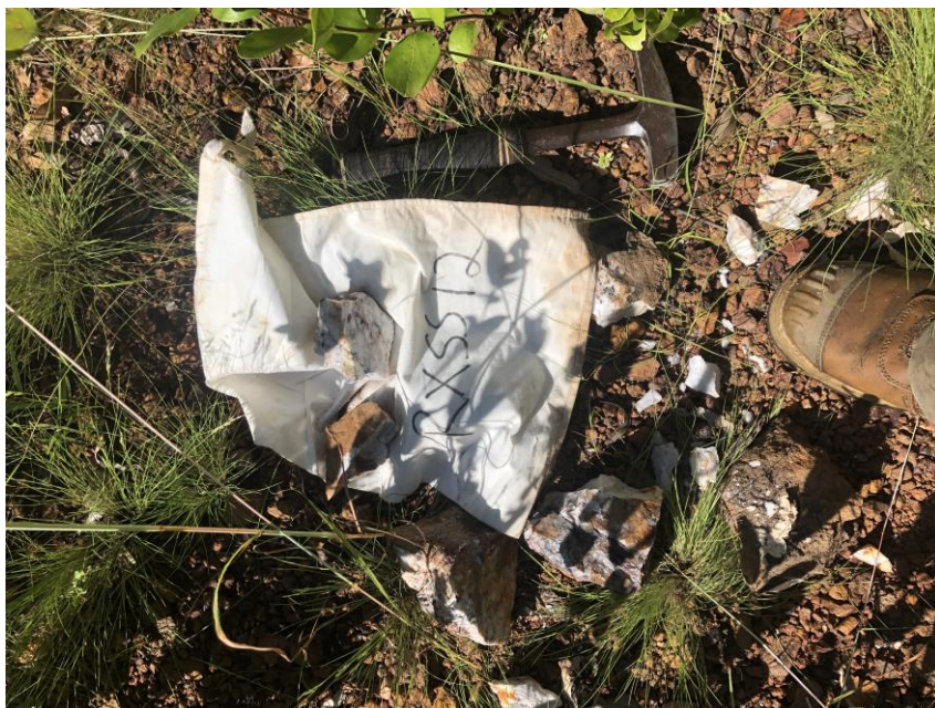
Rock Chip Sampling Targeting Prospective Lithologies/Structures

A total of 7 rock chip samples were collected across the Silver Streak, Specky Creek and Bubbles East prospects along with a further 5 rock chip samples collected from prospective lithologies/structures identified within other areas of the tenement.