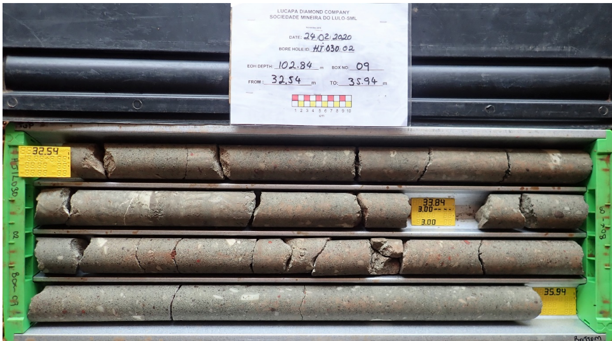
Figure 2: Fresh volcaniclastic kimberlite material (at 32.5m depth) in drill core from L30. Note: kimberlite material was intersected 7m from surface in this hole