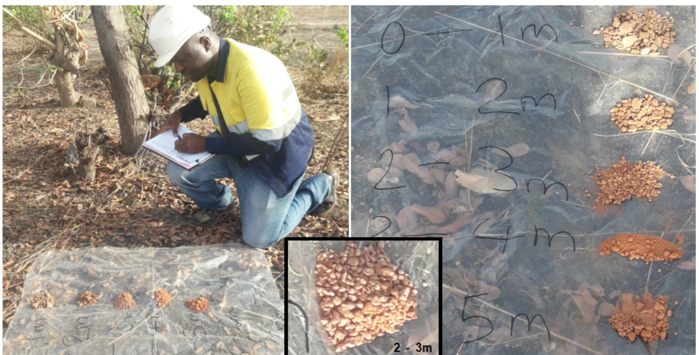
Figure 2: Company Geologist logging Conglomerate Bauxite at Bouba South

Figure 2 below shows one of the Company's Geologists logging the Conglomerate Bauxite from Bouba South during the drilling program.