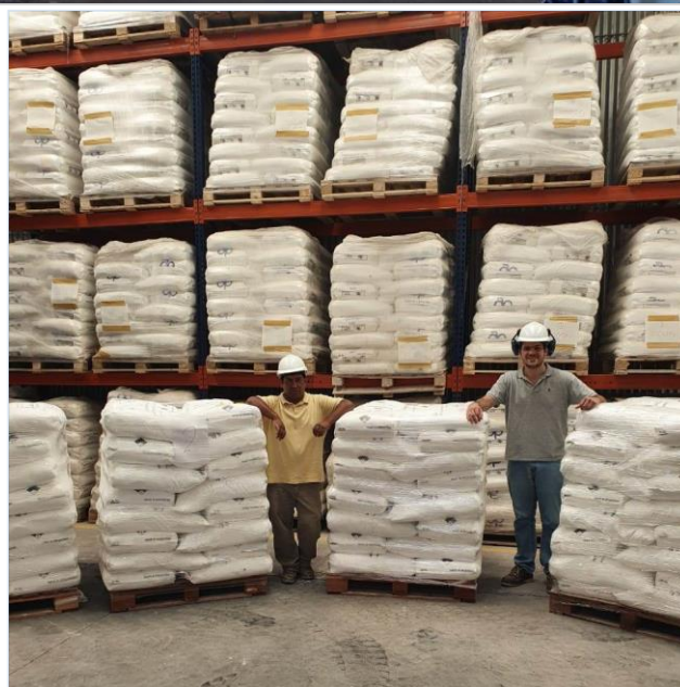
Rincon Lithium Project – Pilot Plant Lithium Carbonate Production Operations