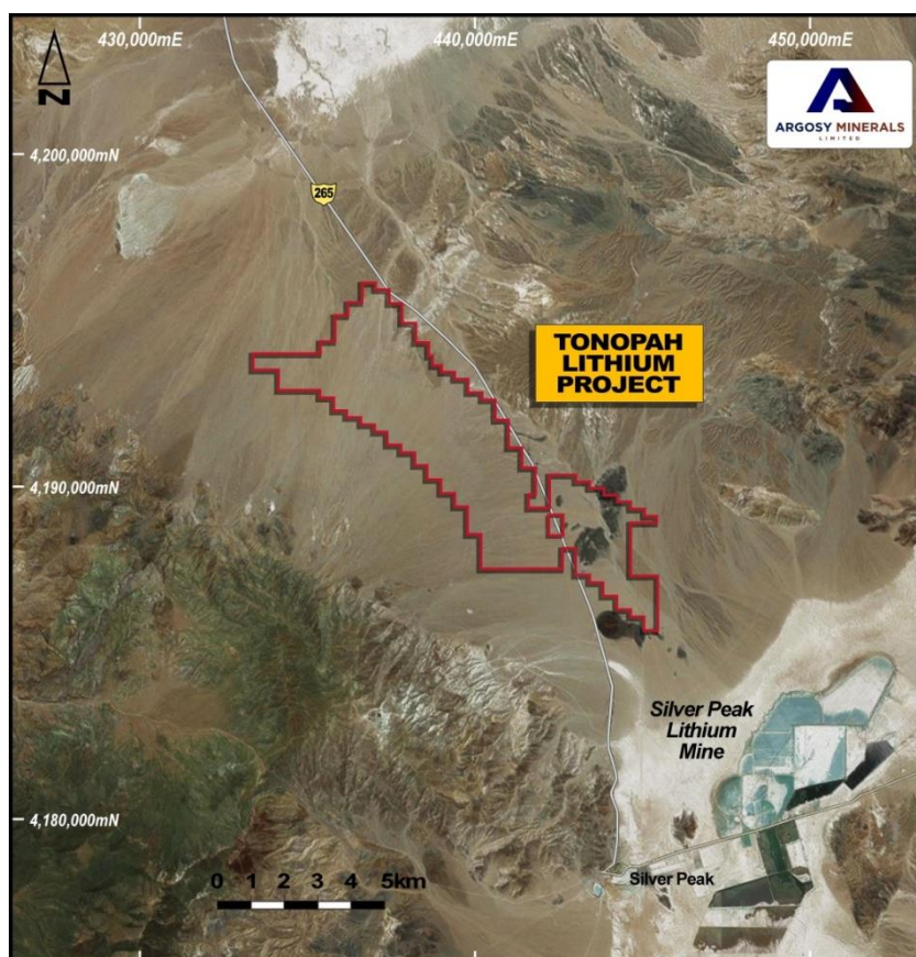
Argosy Minerals Limited – Tonopah Lithium Project Location Map