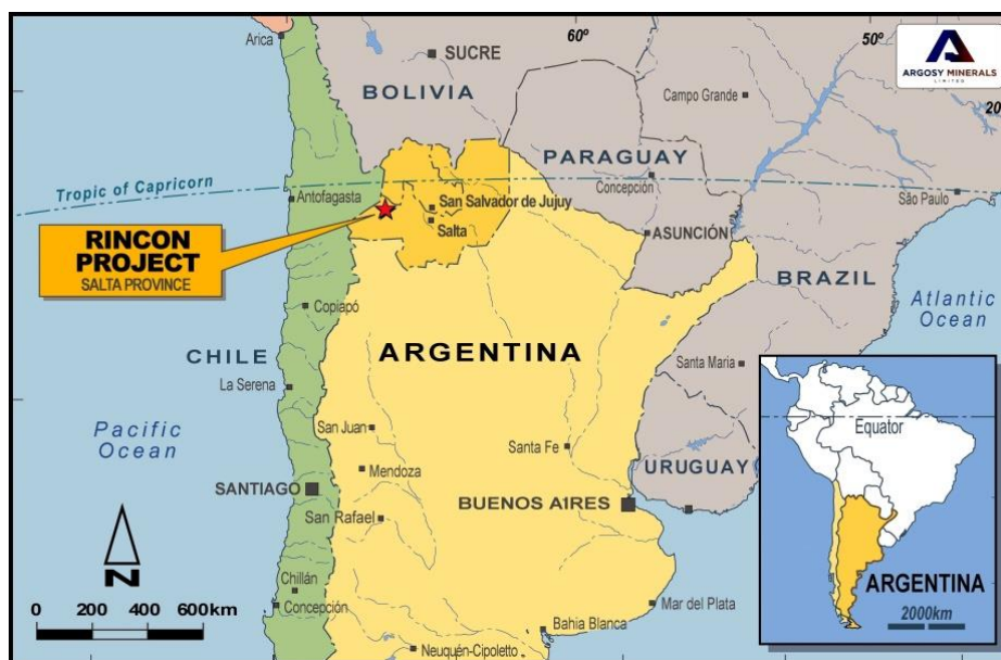
Argosy Minerals Limited – Rincon Lithium Project Location Map