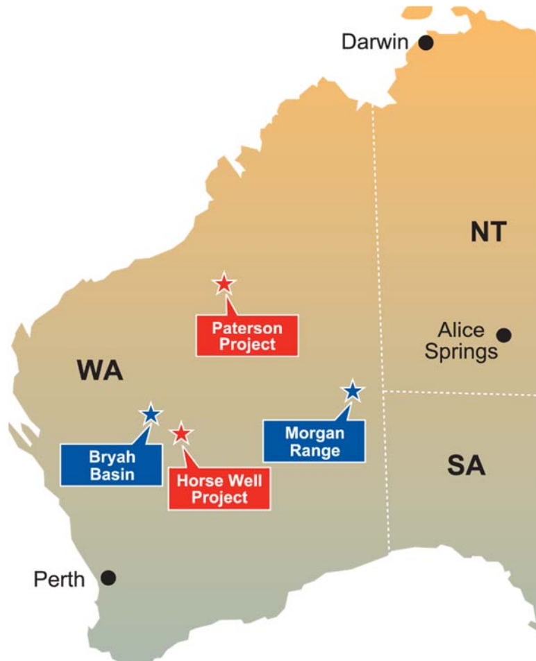
Figure 1 Regional location of Projects following acquisition of Dingo Resources