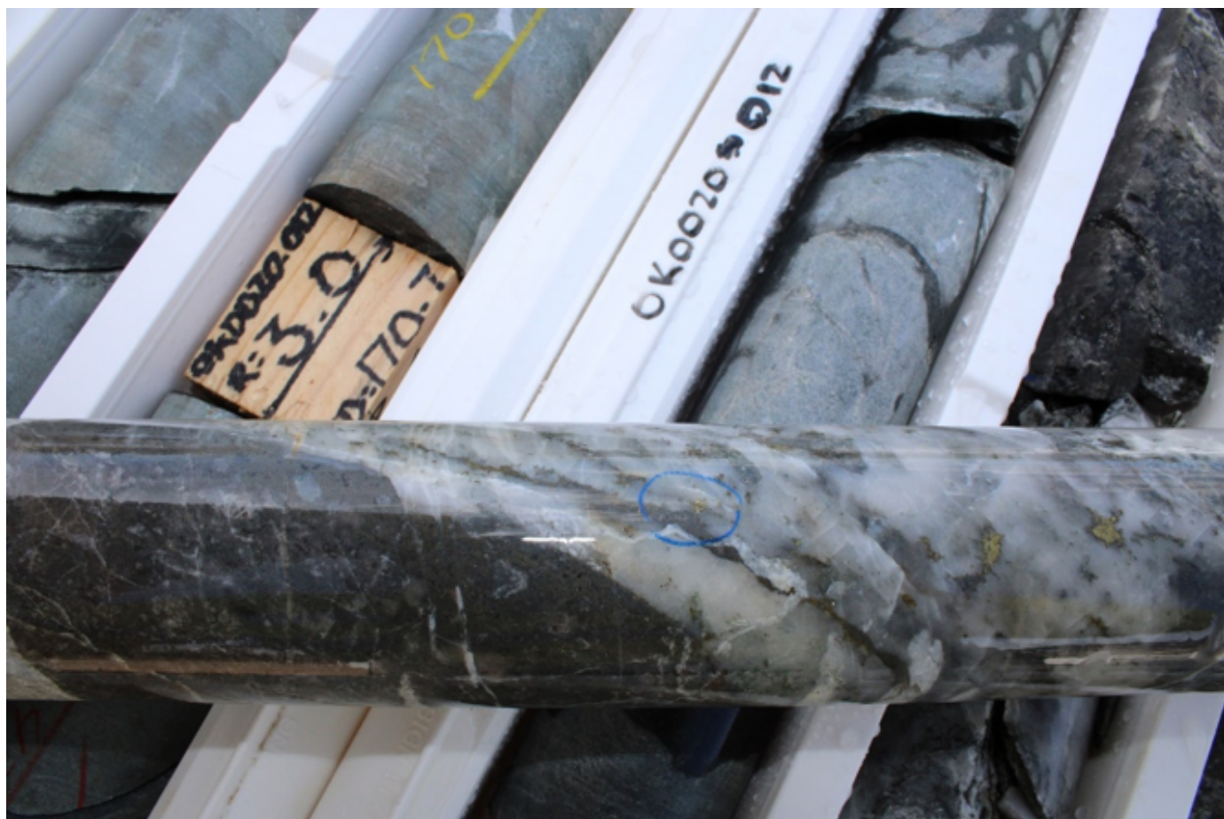
Plate 1. Visible gold in OKDD20_012 from the O2 Lode.

The Indicated and Inferred Mineral Resource at the OK Underground Mine currently stands at 355,000 tonnes @ 18.0 g/t Au for 205,000 ounces with the recent drill results demonstrating the excellent scope for further growth through ongoing exploration.