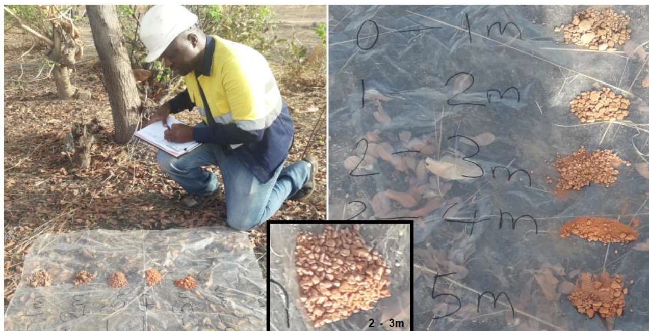
Figure 4: Company Geologist logging Conglomerate Bauxite at Bouba South

Figure 4 below shows one of the Company's Geologists logging the Conglomerate Bauxite from Bouba South during the drilling program.