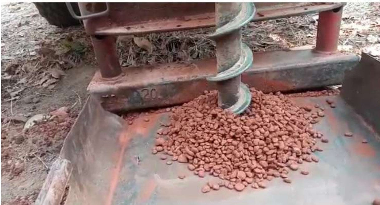
Figure 2: Drilling Conglomerate Bauxite Bouba Plateaux