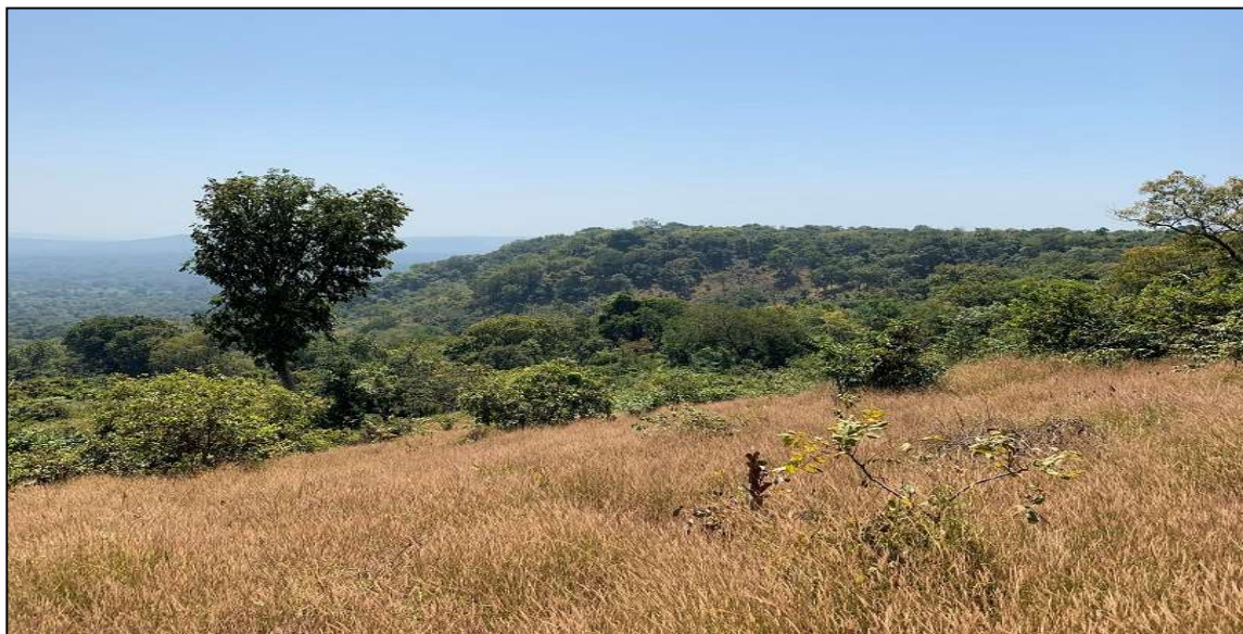
Figure 1: Conglomerate Bauxite Plateaux (Bouba) Looking north

Figure 1 below is the conglomerate Bauxite Plateaux (Bouba) looking north