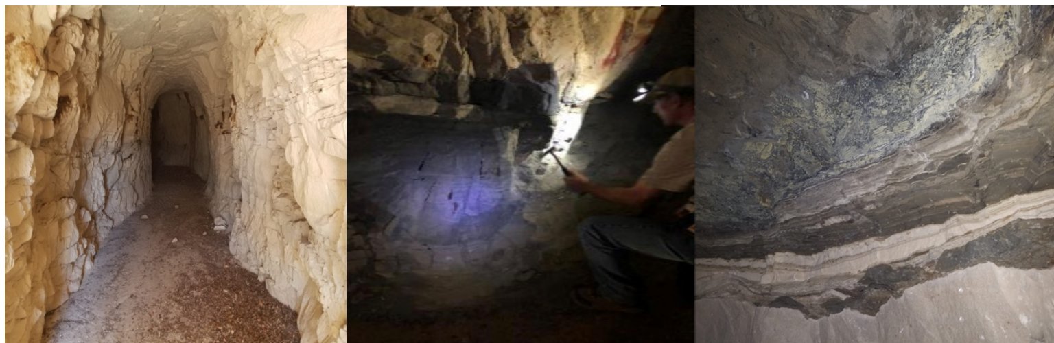
Figure 1 Left: Adit located within the East Canyon Claims Centre: Geologist at exposed mineralisation face Right: Visible mineralisation within workings at Project