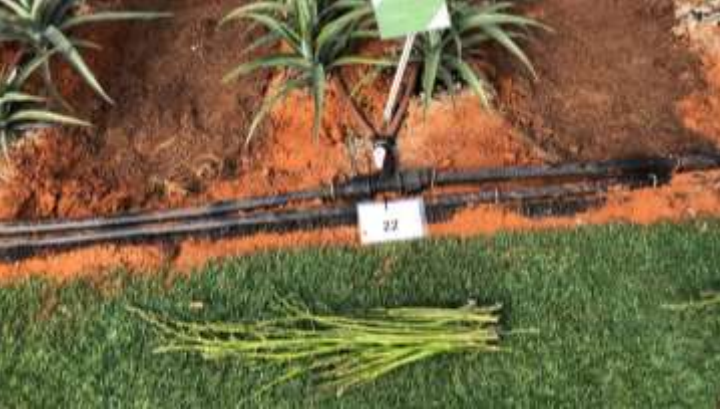
Image 1: Heated asparagus on the left with the control crop shown right