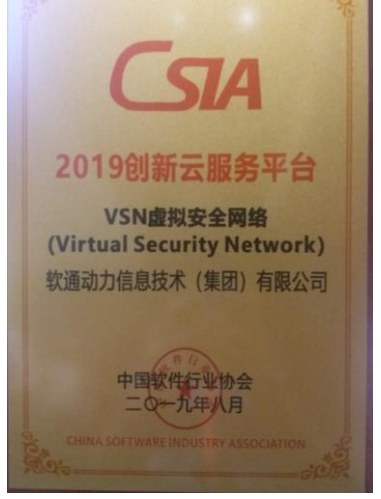
VSN – 2019 Innovative Cloud Service Platform by China Software Industry Association (CSIA)