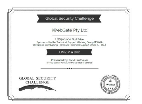
Winner of Global Security Challenge by US Dept. of Defense