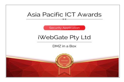
Asia Pacific ICT Awards